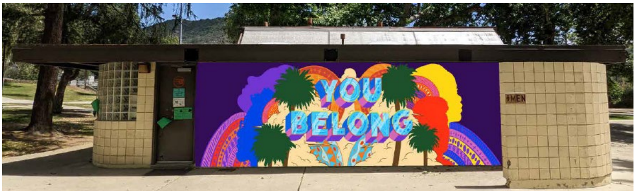
Alternate Recommendation: “You Belong” by Ndubisi Okoye

The complete artist proposals are also included as Exhibits C and D attached to this report as reference.