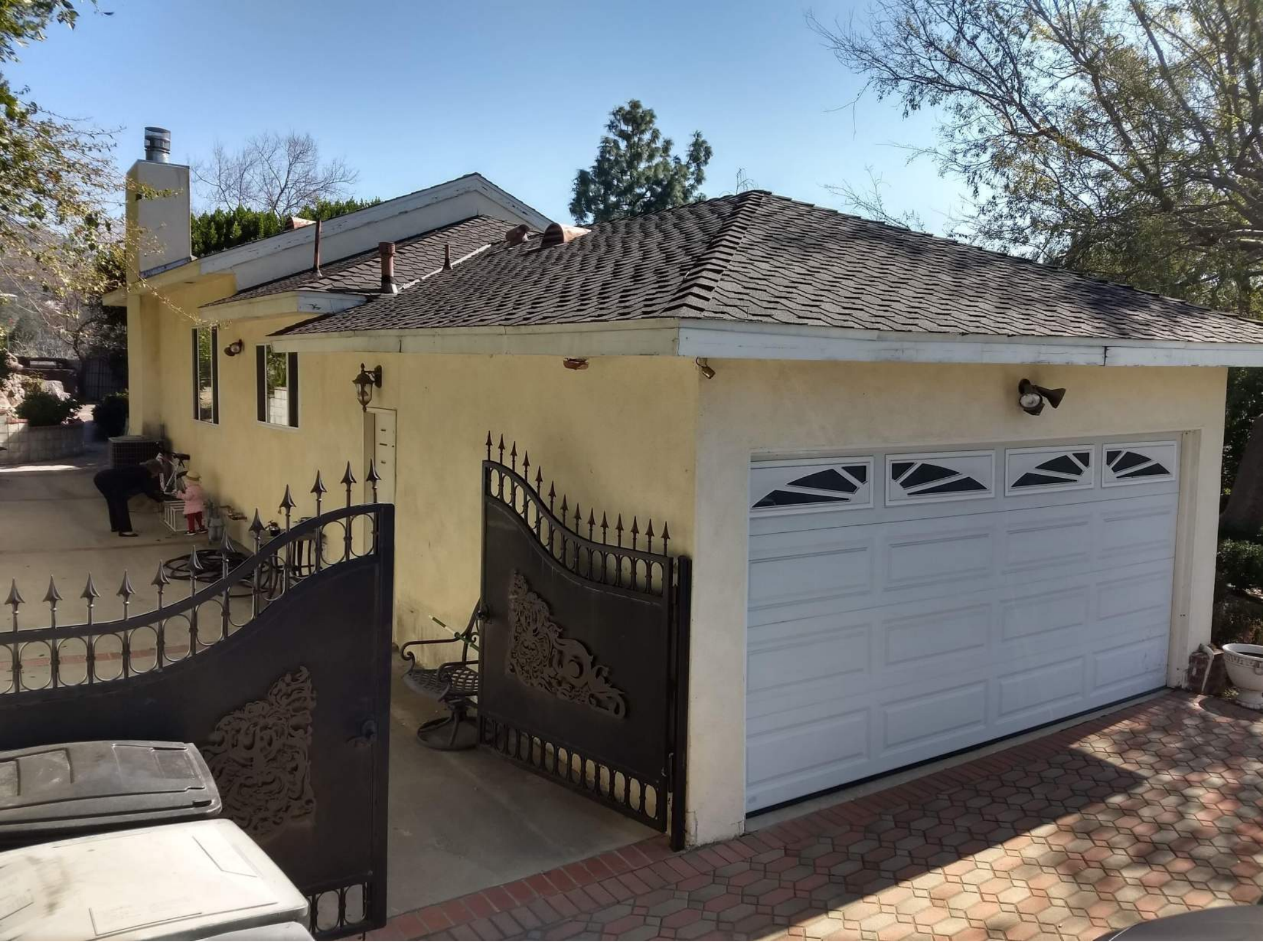
Page 6 of 14