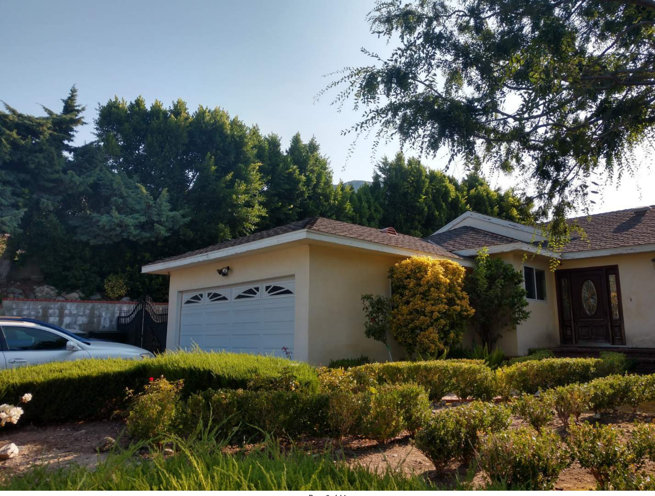
Page 3 of 14