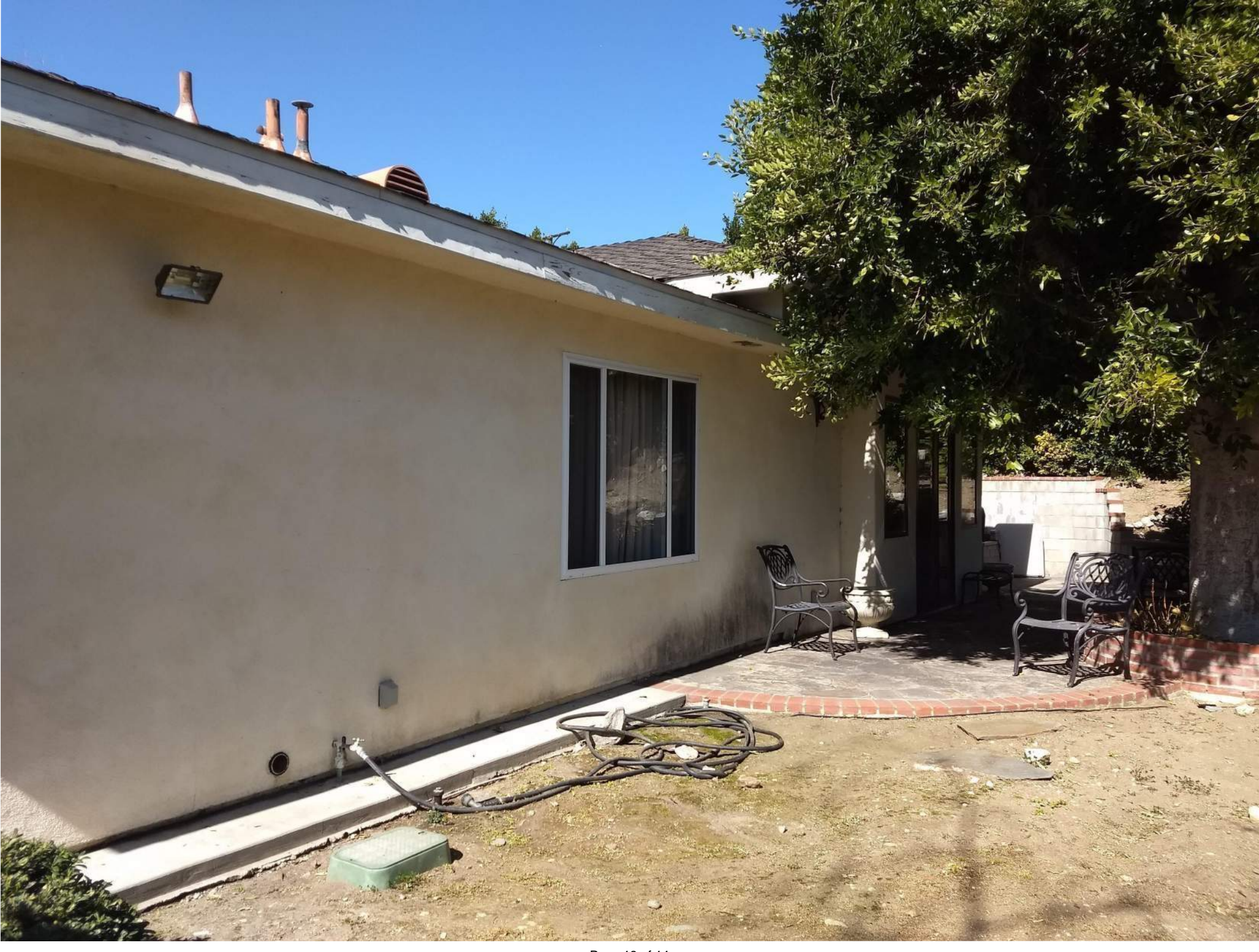
Page 13 of 14