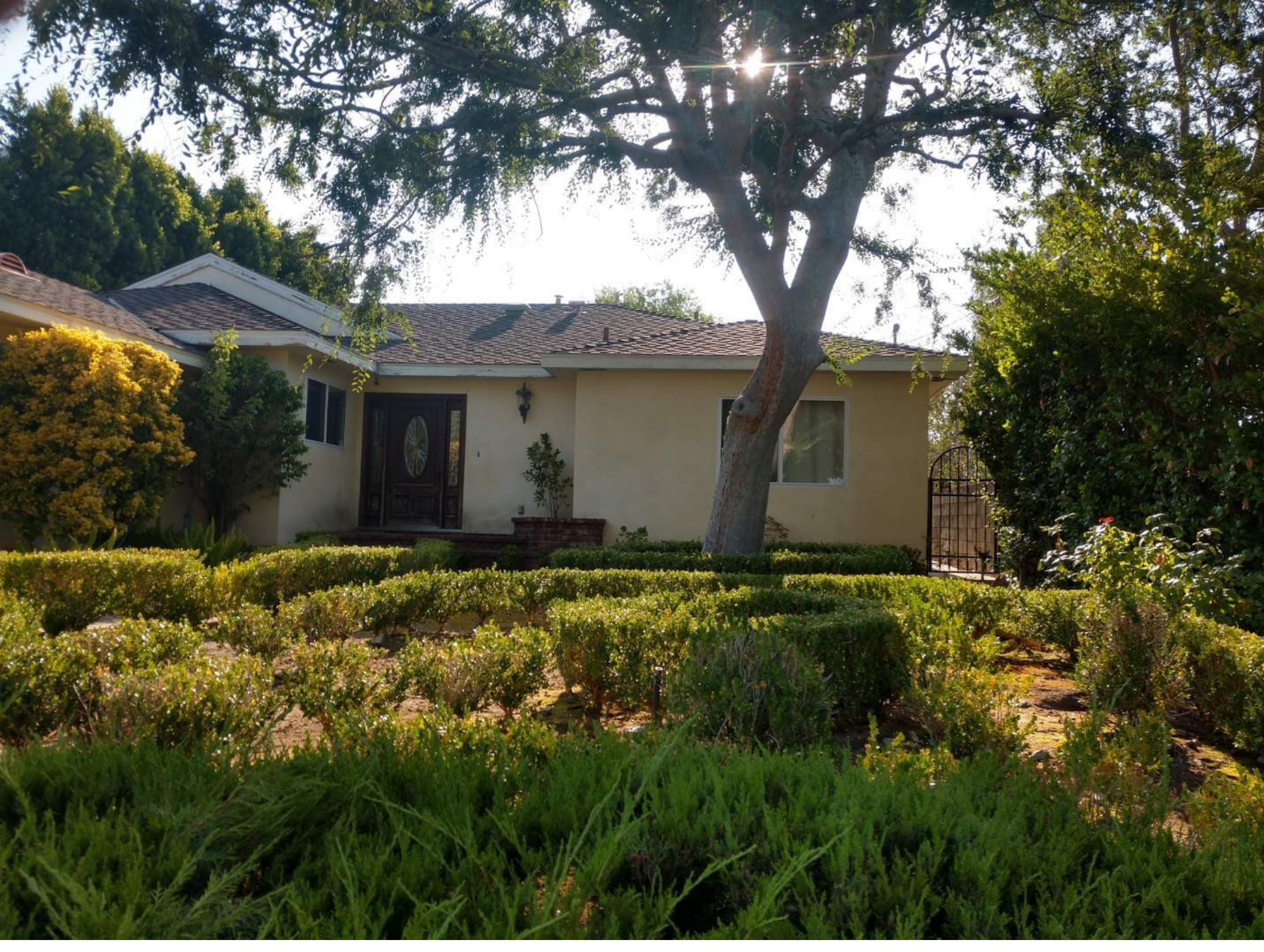
Page 2 of 14