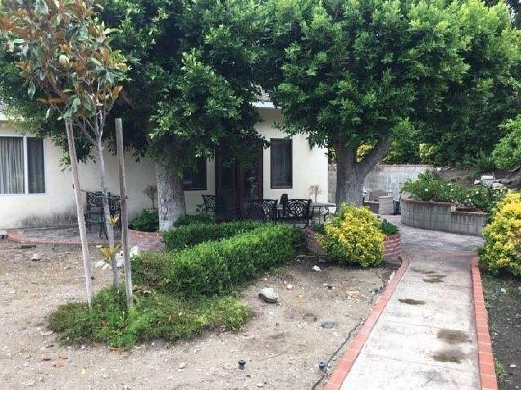
Page 12 of 14