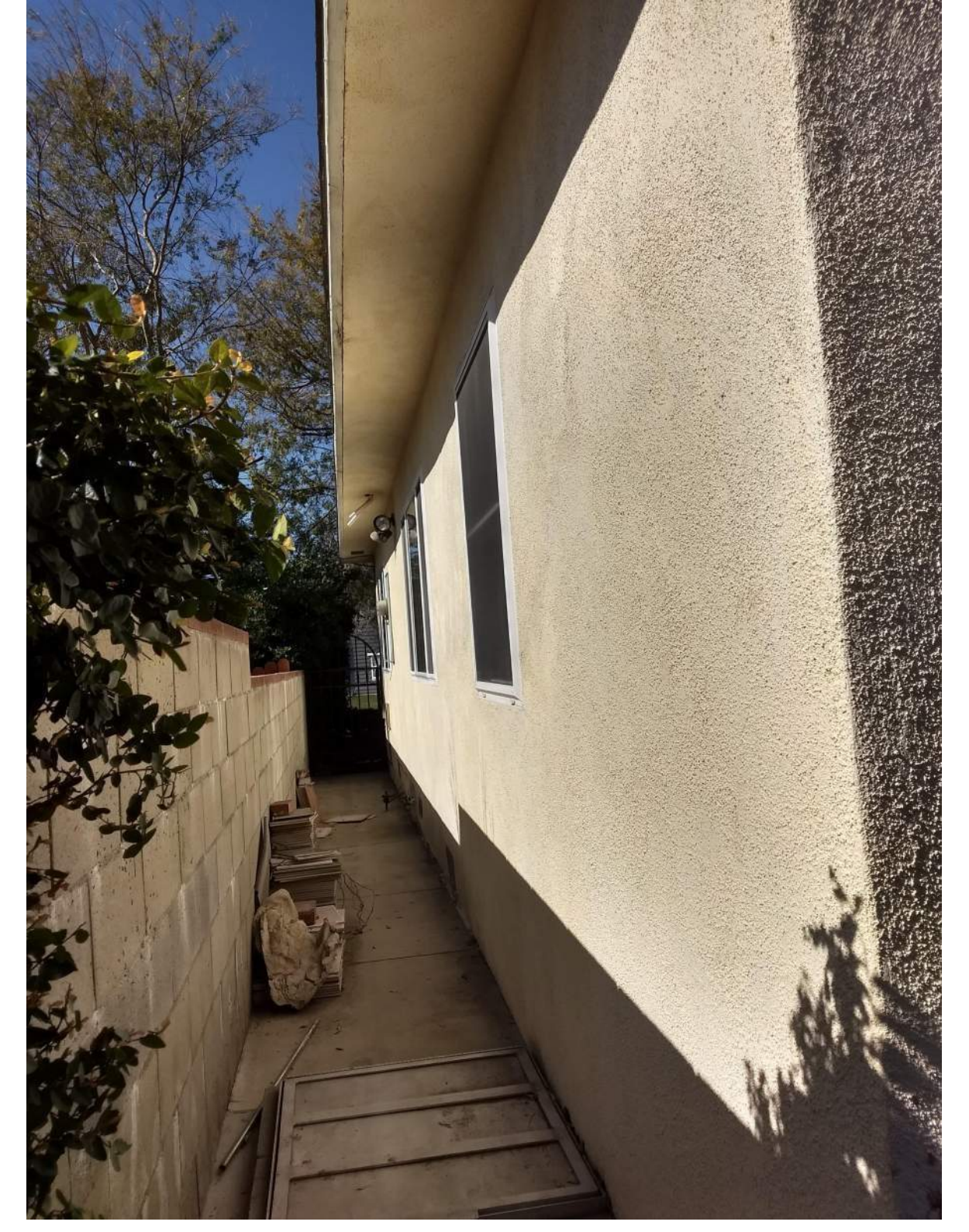
Page 14 of 14