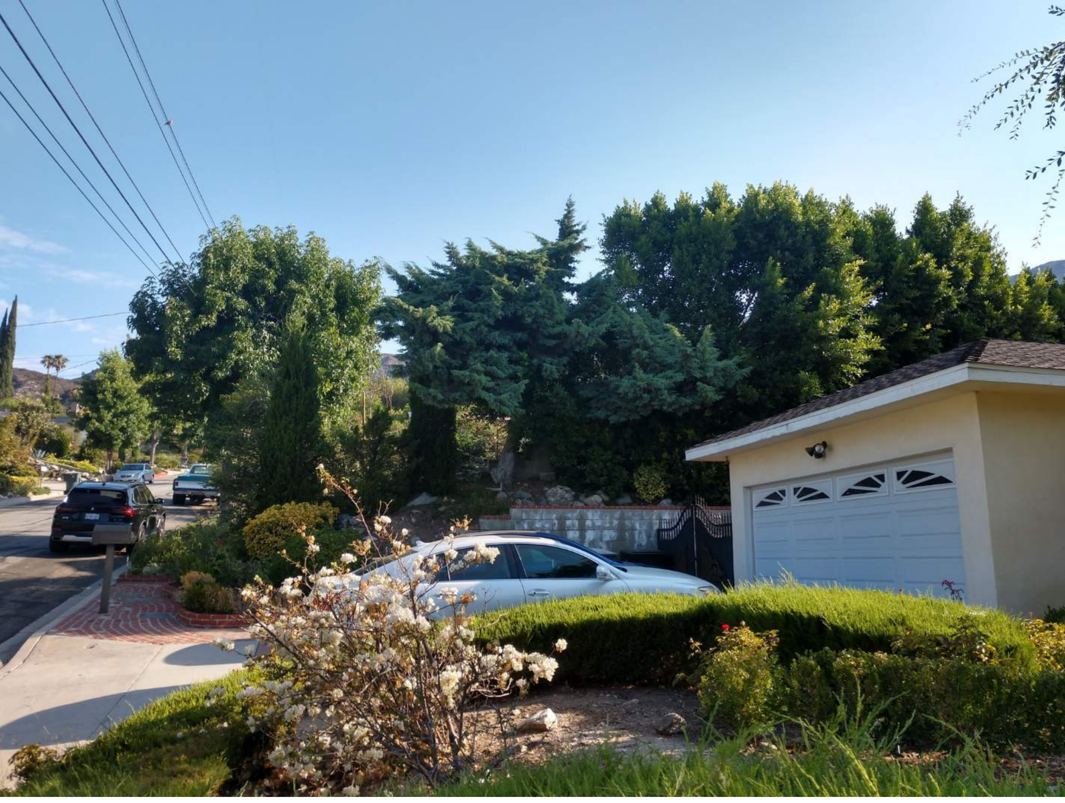
Page 4 of 14