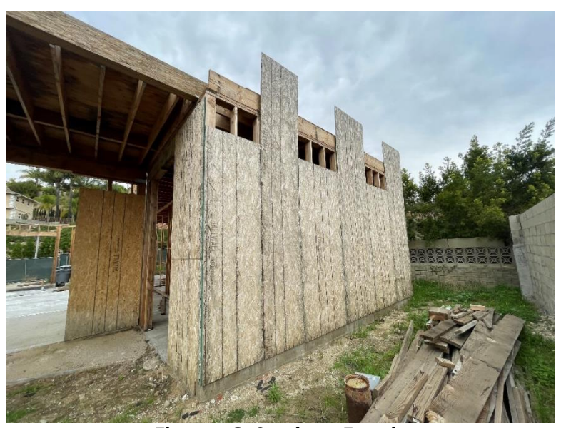
Figure 2C. Southern Façade

The eastern façade of the building is under construction and has been covered with plywood sheeting (Figure 3, Eastern Façade).