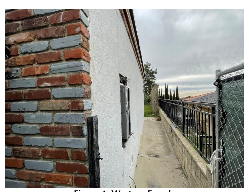
Figure 4. Western Façade

The wester façade of the building features what remains of the garage, has a flat roof, and is clad in stucco (Figure 4, Western Façade).