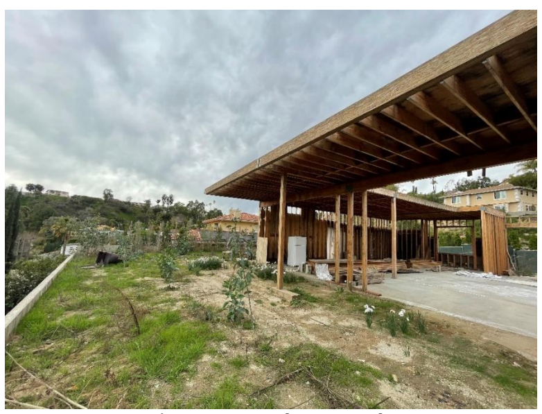
Figure 2B. Southern Façade