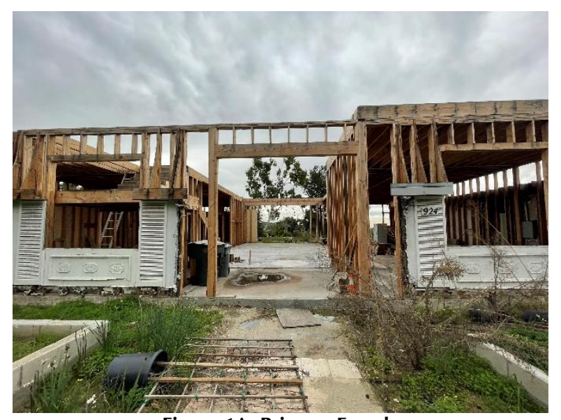
Figure 1A. Primary Façade

The subject property located at 924 Old Phillips Road is located on the southern side of Old Phillips Road on a large rectangular lot. The building is set back approximately 10 feet from the public right-of-way. The residential building is a one-story, Mansard-style, currently under construction with an asymmetrical footprint. The building features a flat roof section located above the garage, and the mansard roof sections were removed during construction (Figure 1A, Primary Façade ). The remaining primary façade features stucco cladding, brick veneer, and two tilt-up garage doors (Figure 1B).