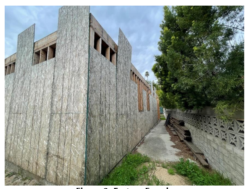
Figure 3. Eastern Façade

The wester façade of the building features what remains of the garage, has a flat roof, and is clad in stucco (Figure 4, Western Façade).