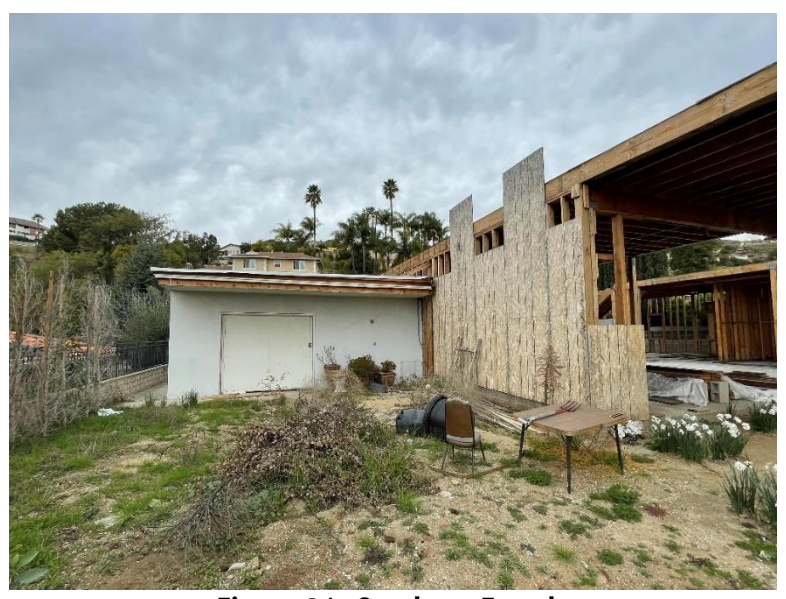
Figure 2A. Southern Façade

The southern façade features what remains of the two-car garage. The southern façade of the garage has a flat roof, tilt-up garage door, and is clad in stucco. The fascia boards were removed during the recent construction. The remainder of the southern façade is under construction and various sections have been covered with plywood sheeting (Figures 2A–C, Southern Façade ).