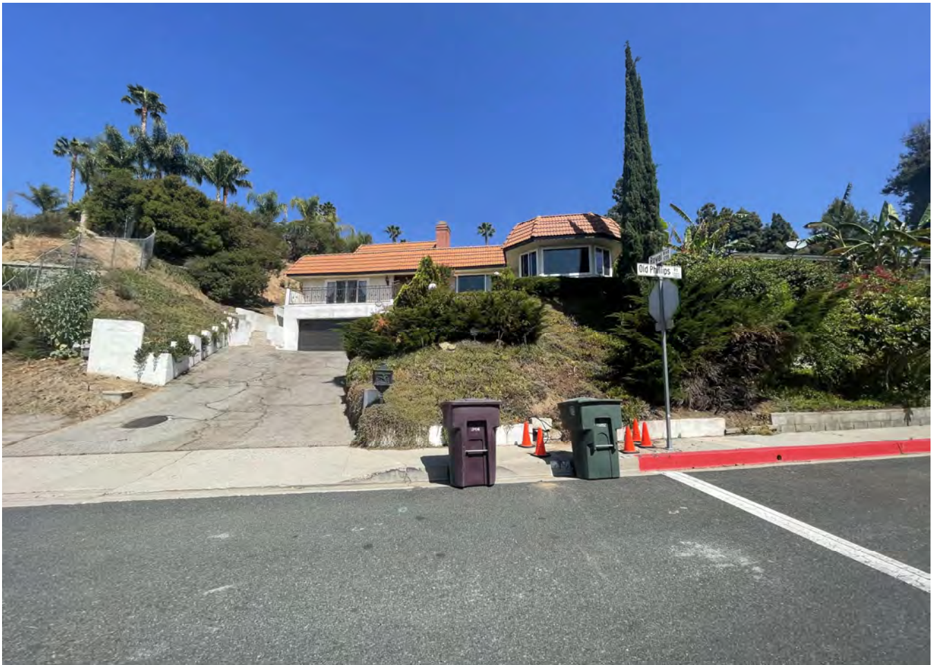
E. 1003 OLD PHILLIPS RD