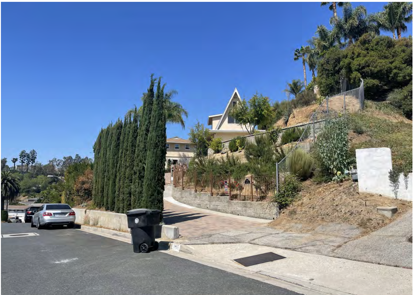
F. 1755 OLD PHILLIPS RD