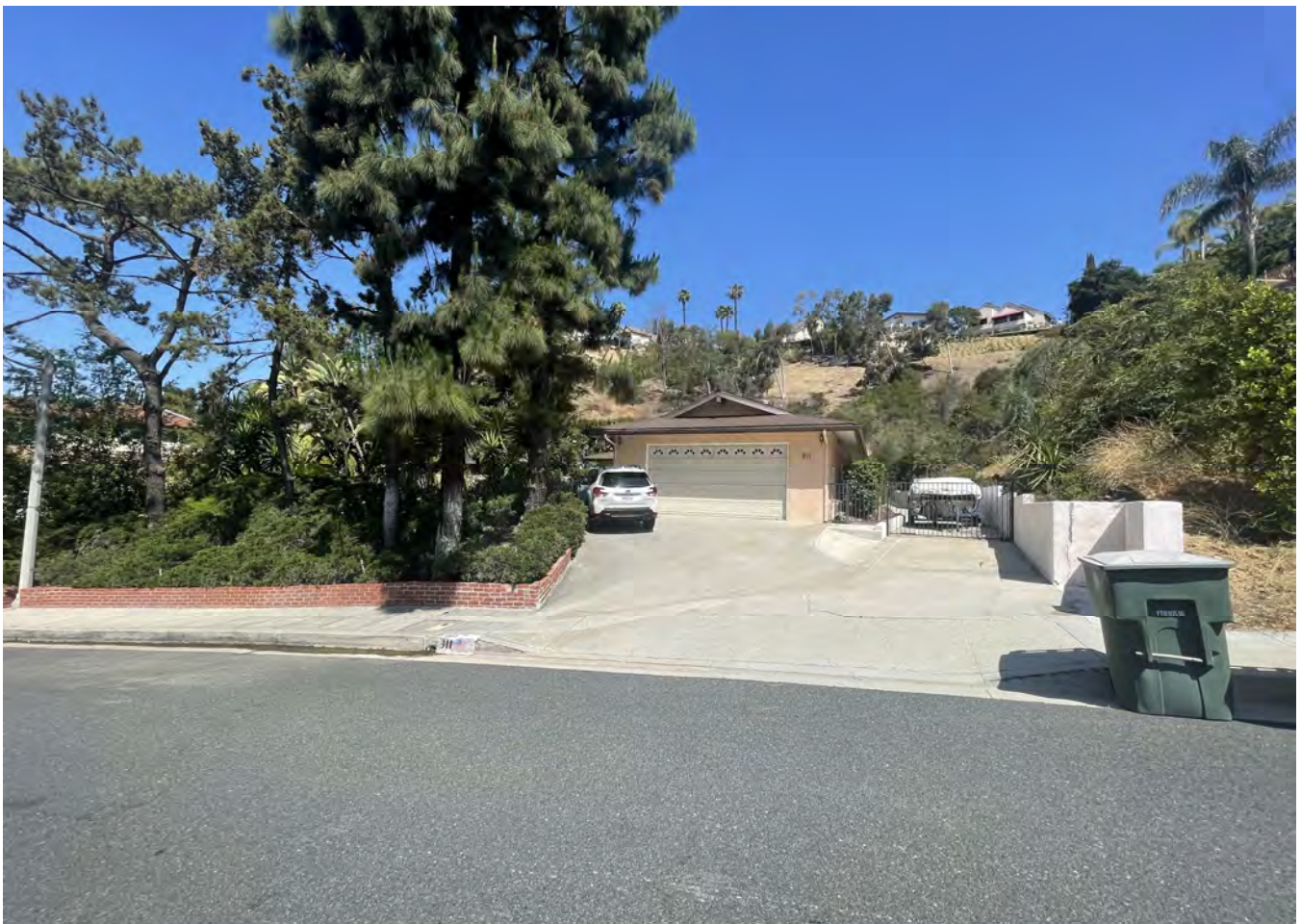
G. 911 OLD PHILLIPS RD