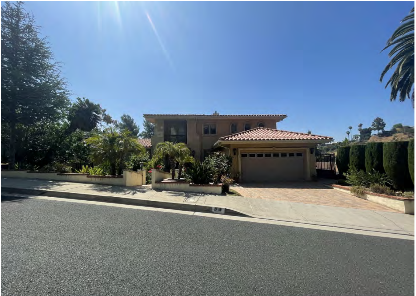
L. 918 OLD PHILLIPS RD