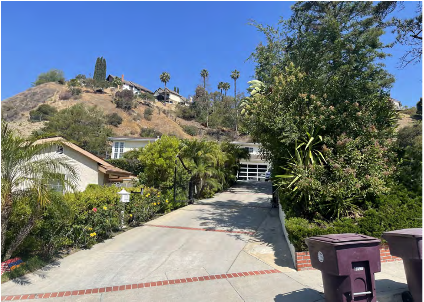
H. 907 OLD PHILLIPS RD