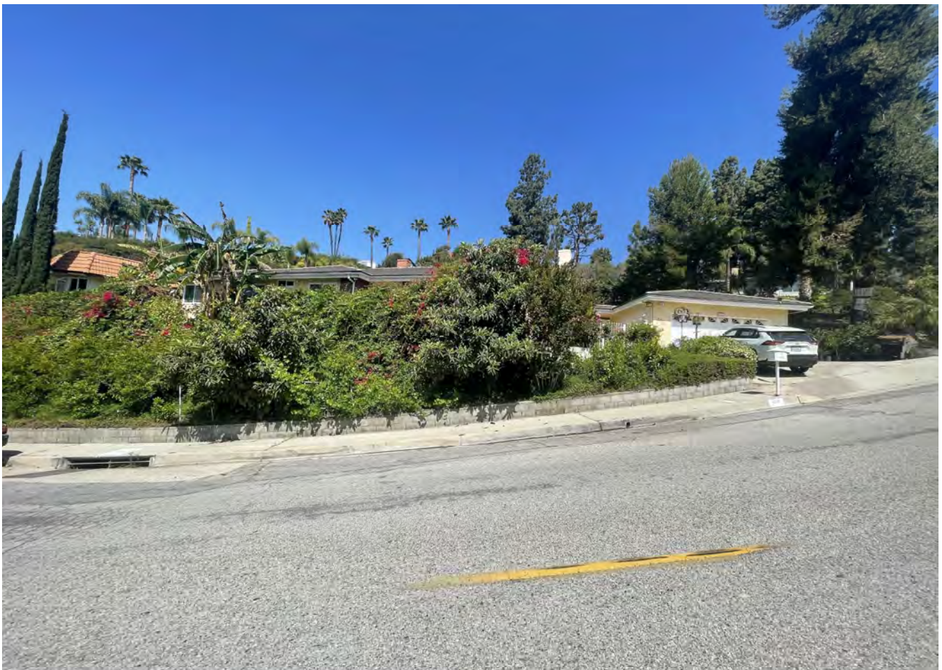
D. 1011 OLD PHILLIPS RD