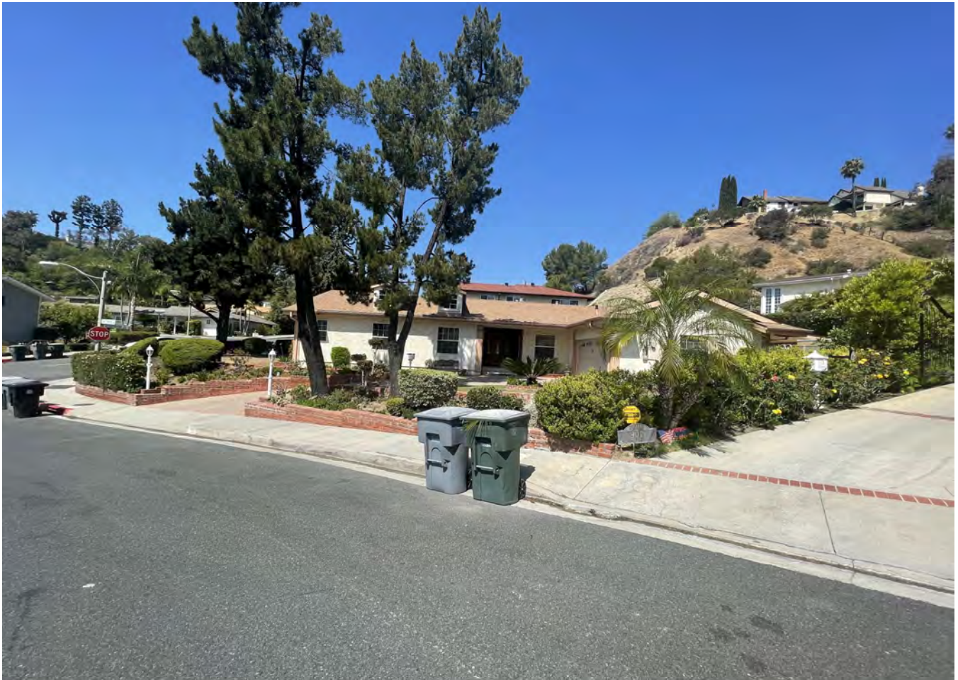
I. 1080 GREENBRIAR RD