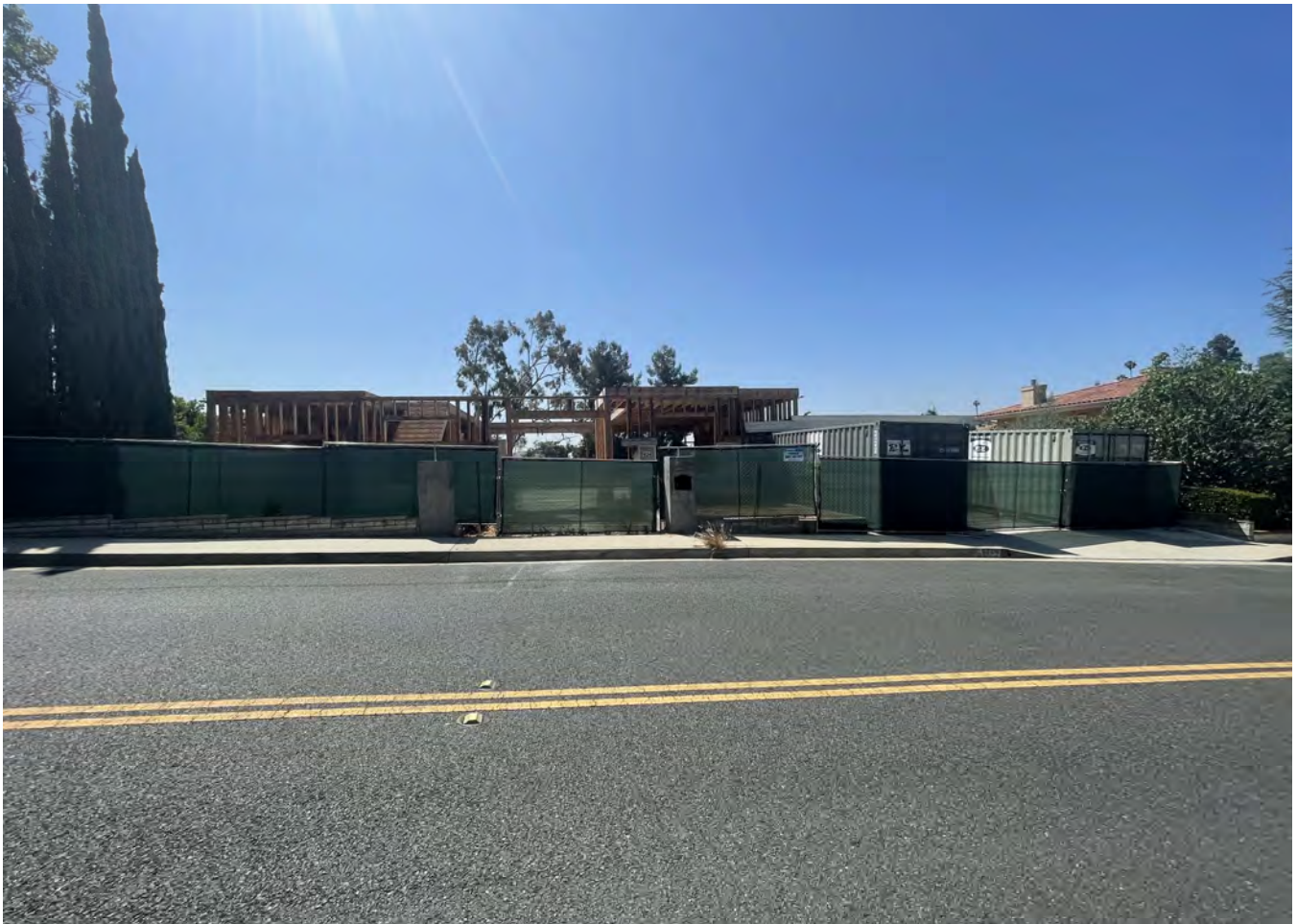
A. 924 OLD PHILLIPS RD