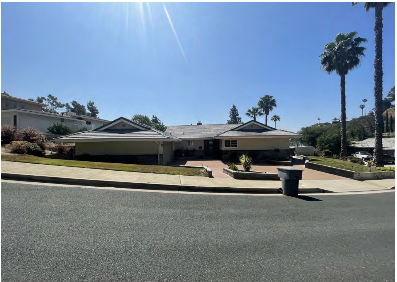
J. 900 OLD PHILLIPS RD