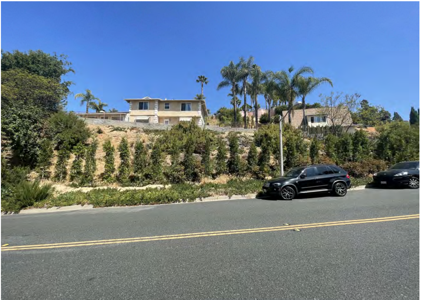
F. 1755 OLD PHILLIPS RD