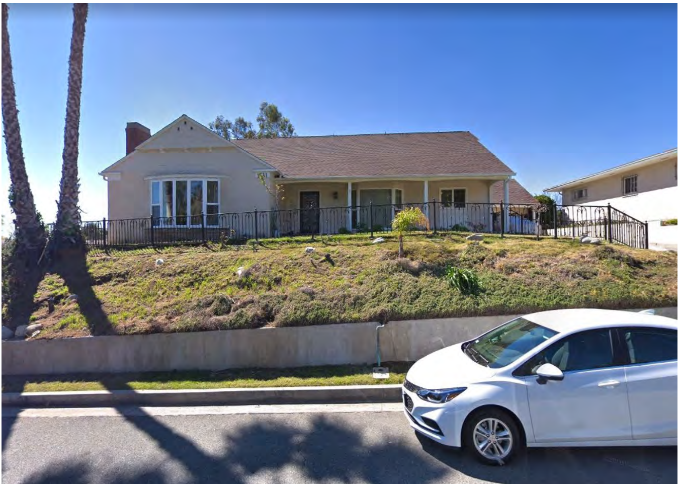
M. 1741 ROYAL BLVD