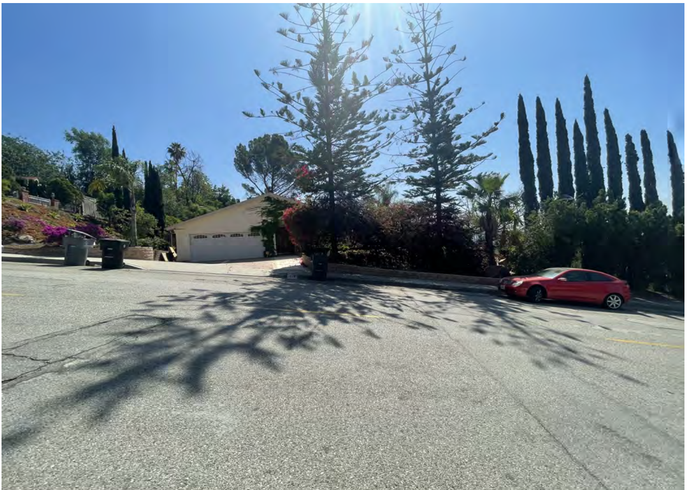
C. 1016 OLD PHILLIPS RD