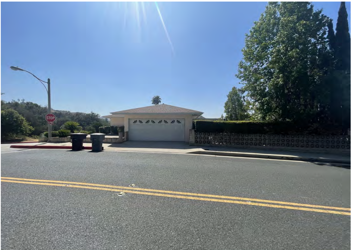
B. 1751 ROYAL BLVD