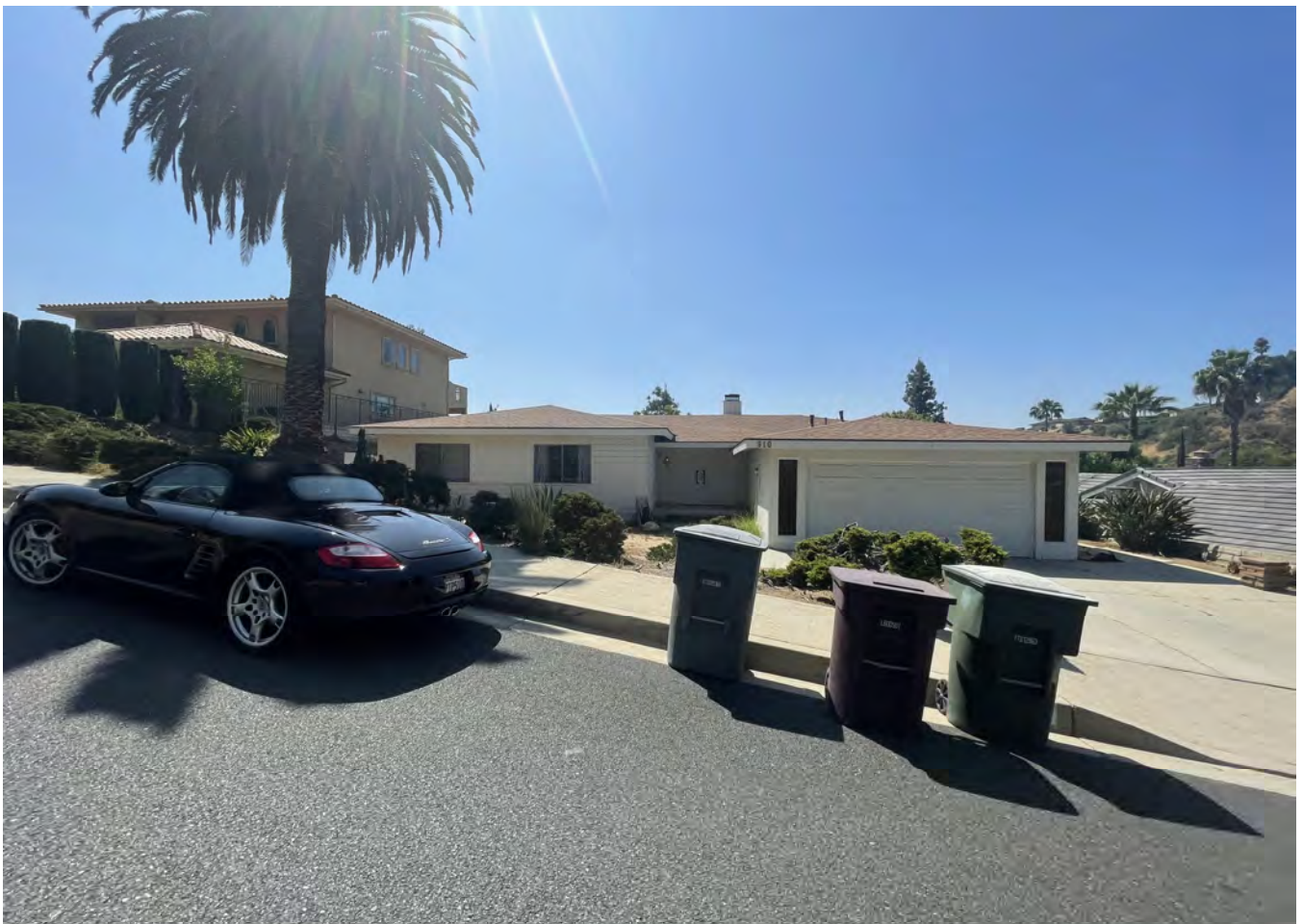
K. 910 OLD PHILLIPS RD