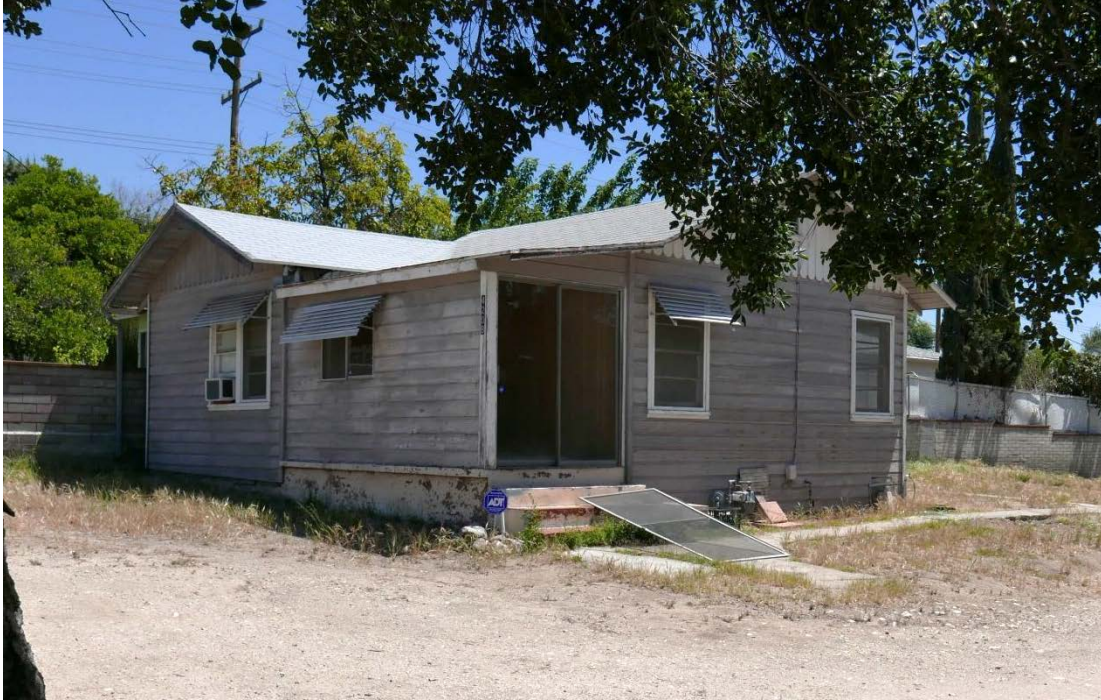
Figure 1. Primary Façade (Southern), 4208 New York Avenue

The east and west secondary facades are in keeping with the design and materials of the primary façade. The west façade also has paired double-hung two-light windows with wood surrounds as well as a smaller aluminum casement window (Figure 2, Secondary Façade [Western], 4208 New York Avenue ).