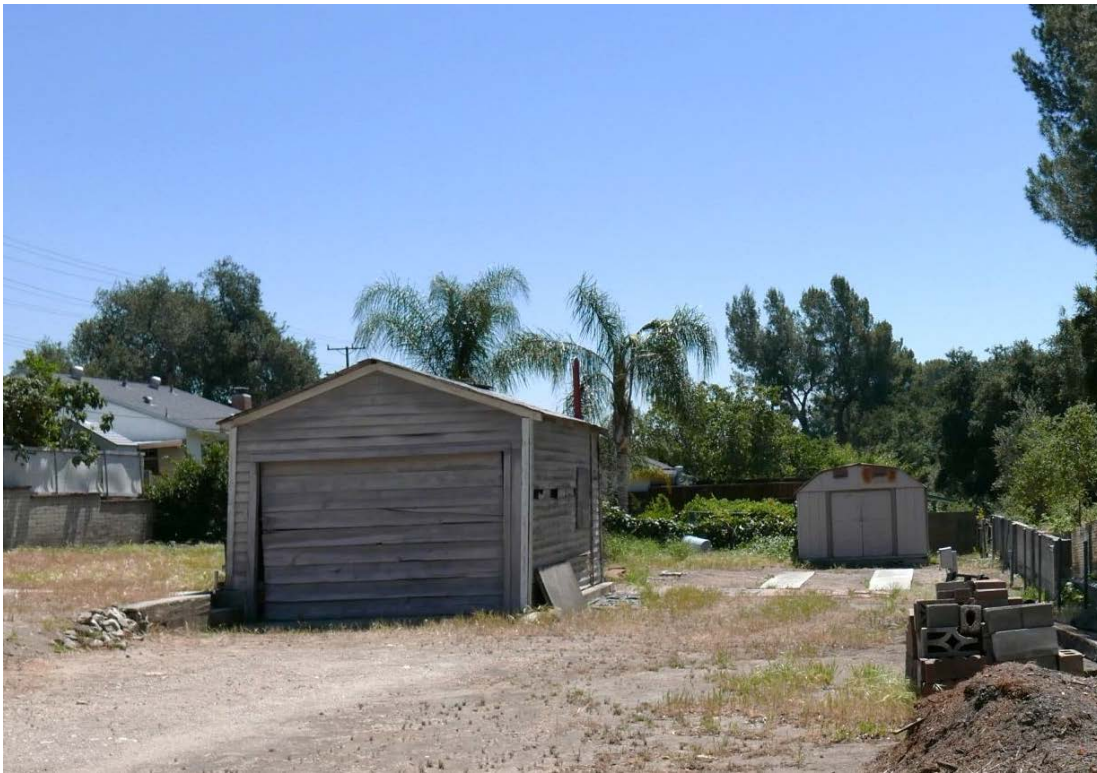
Figure 3. Garage and Pre-fabricated Shed, 4208 New York Avenue

Located on the lot is a pre-fabricated shed that was likely installed in the 1990s (Figure 3, Garage and Pre-fabricated Shed, 4208 New York Avenue ).