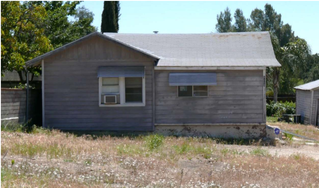
Figure 2. Secondary Façade (Western), 4208 New York Avenue

The east and west secondary facades are in keeping with the design and materials of the primary façade. The west façade also has paired double-hung two-light windows with wood surrounds as well as a smaller aluminum casement window (Figure 2, Secondary Façade [Western], 4208 New York Avenue ).