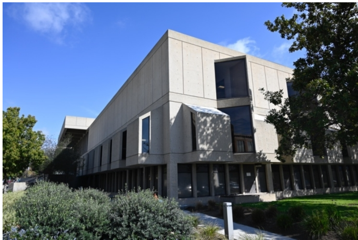
North and West Facades