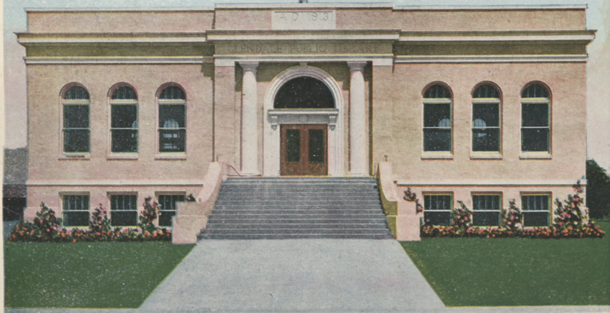
Glendale Public Library, Glendale, California