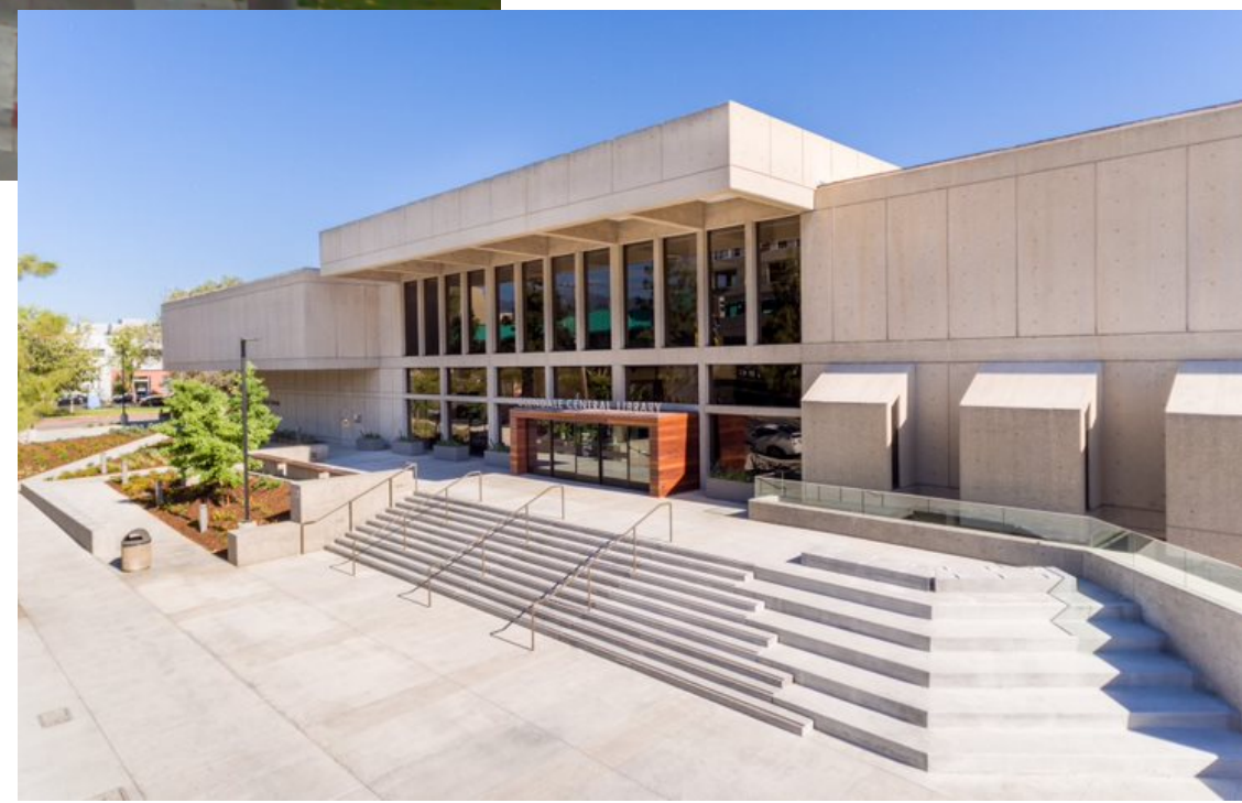
North Façade: before and after 2017 rehabilitation