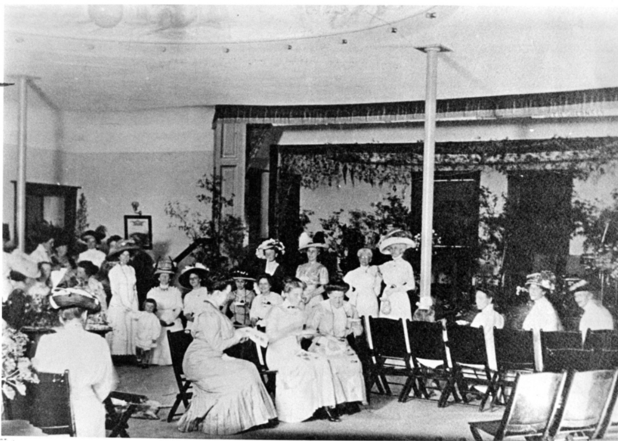
Tuesday Afternoon Club