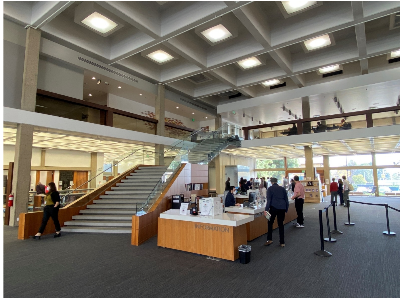
2017 interventions in Main Reading Room