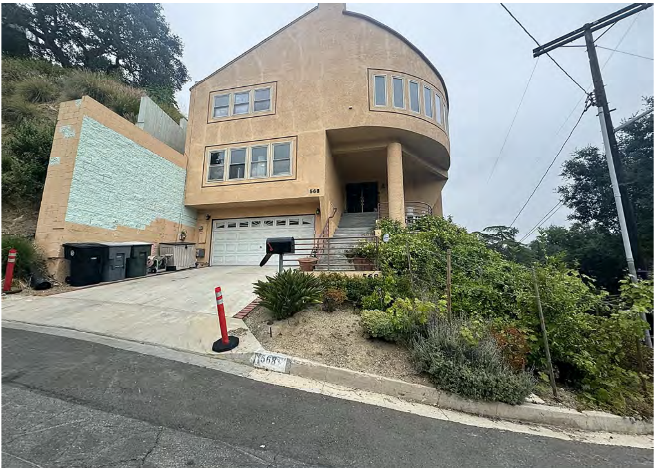
I. 568 ARCH PL