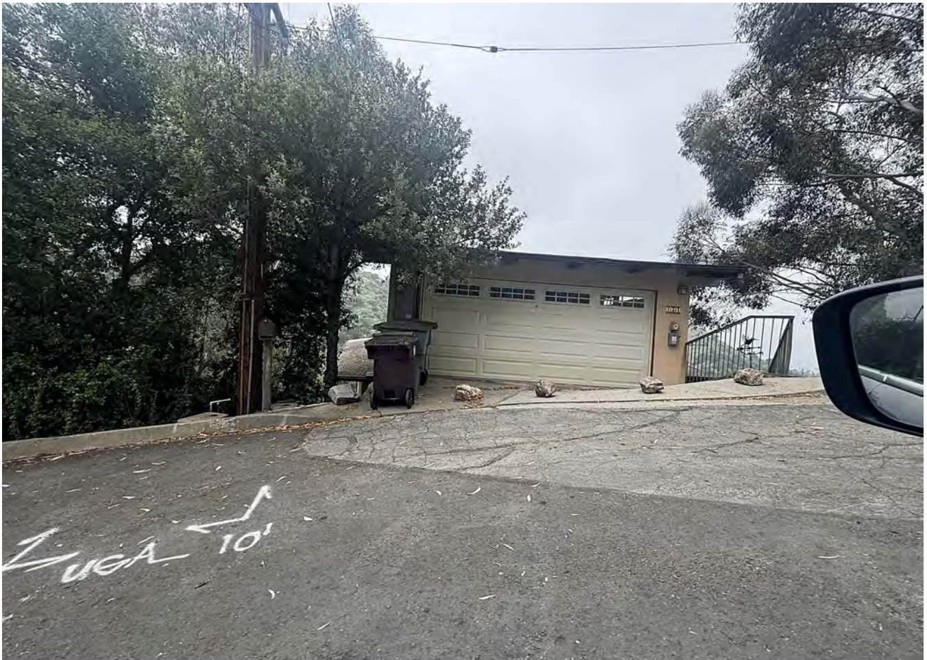
C. 589 ARCH PL