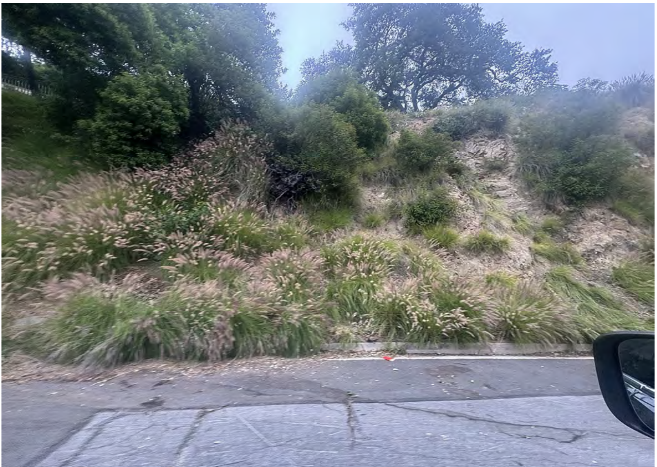
J. VACANT LOT | APN # 5666-008-008