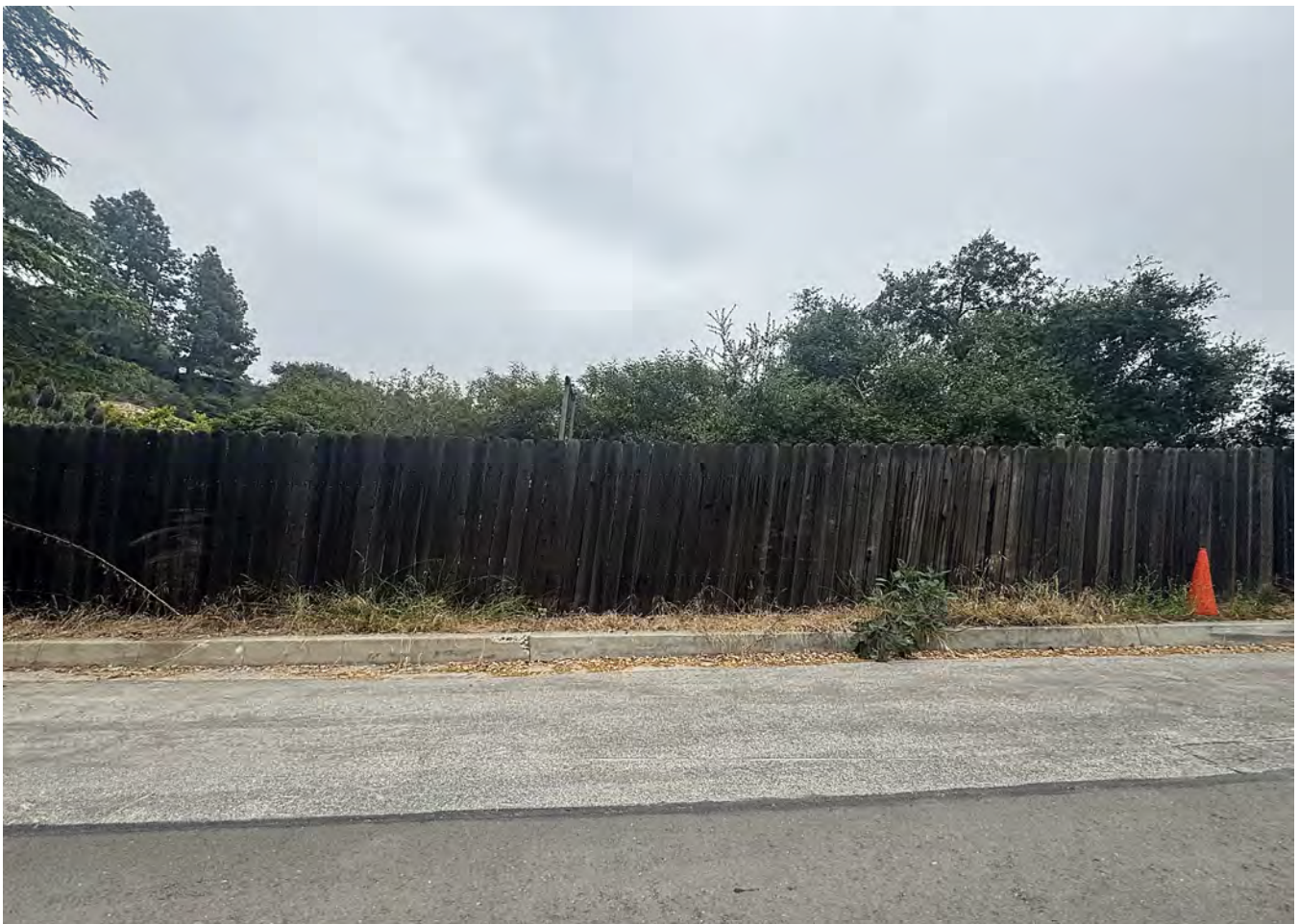
H. 529 ARCH PL