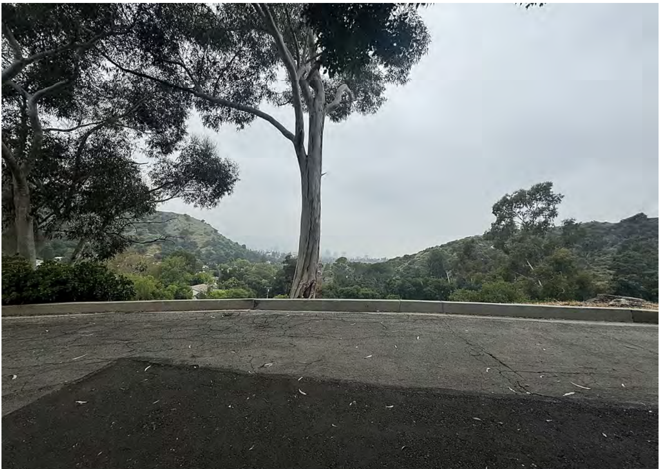
B. VACANT LOT | APN # 5666-004-020