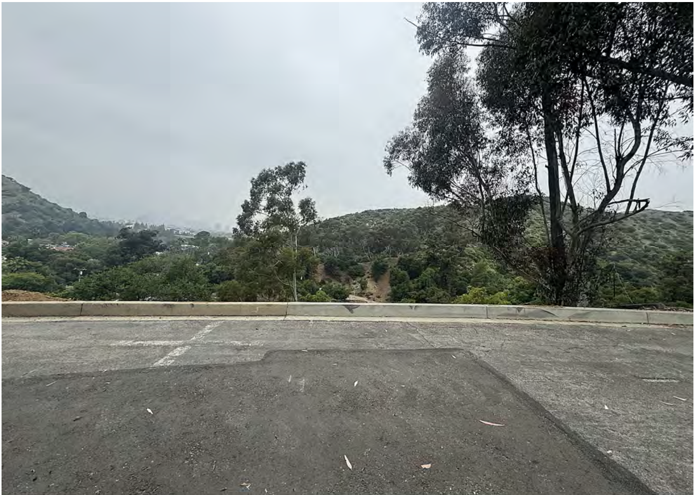
A. 589 ARCH PL