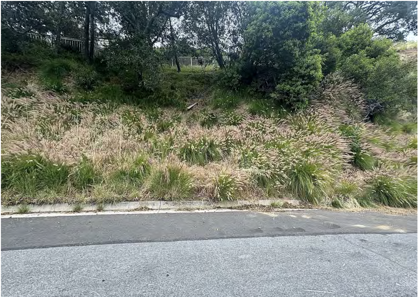
L. 2300 GARDNER PL