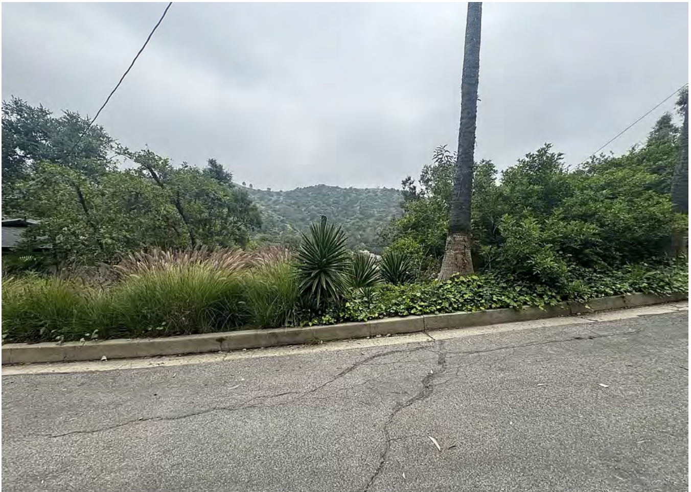
E. VACANT LOT | APN # 566-004-023