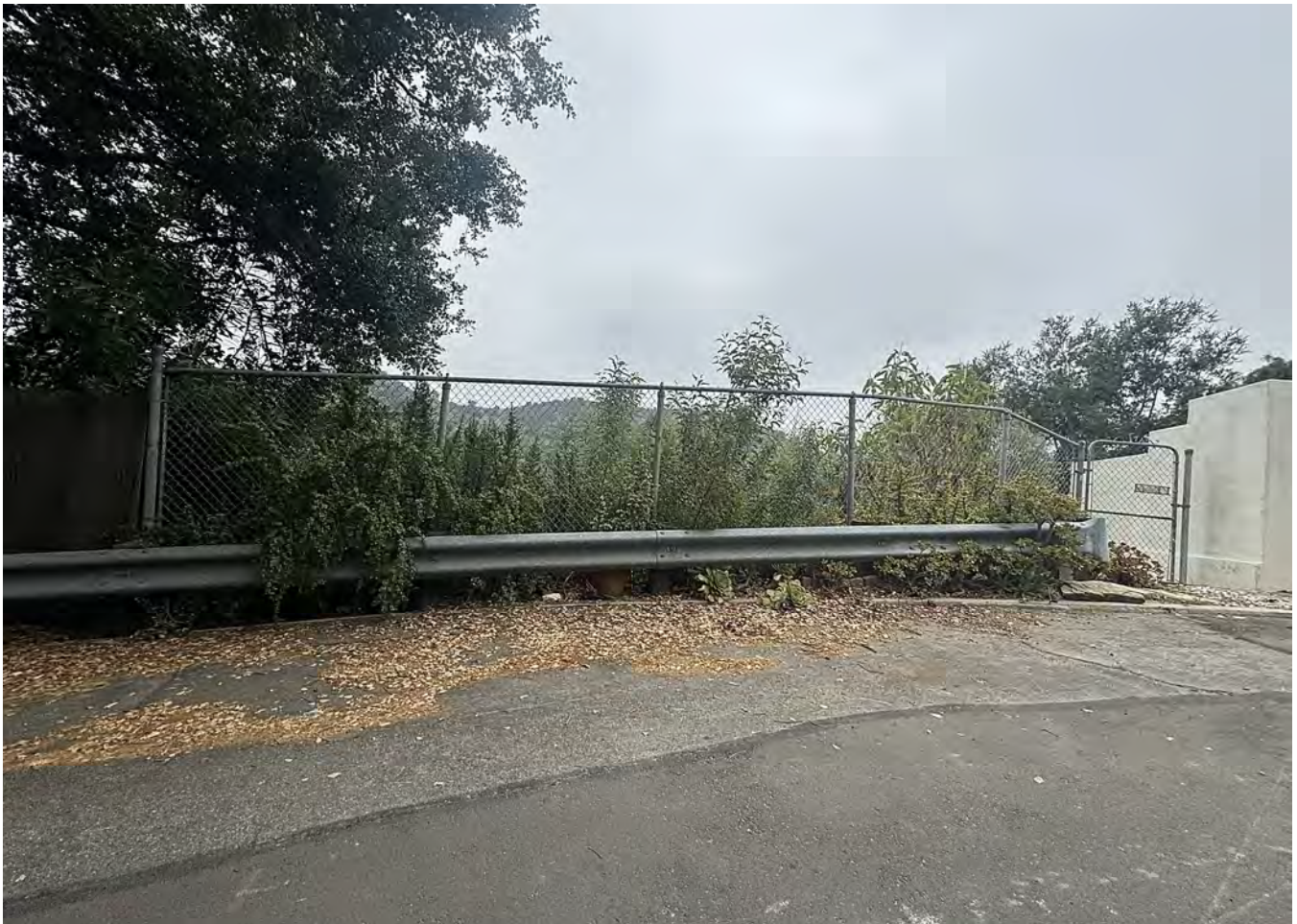
G. 519 ARCH PL