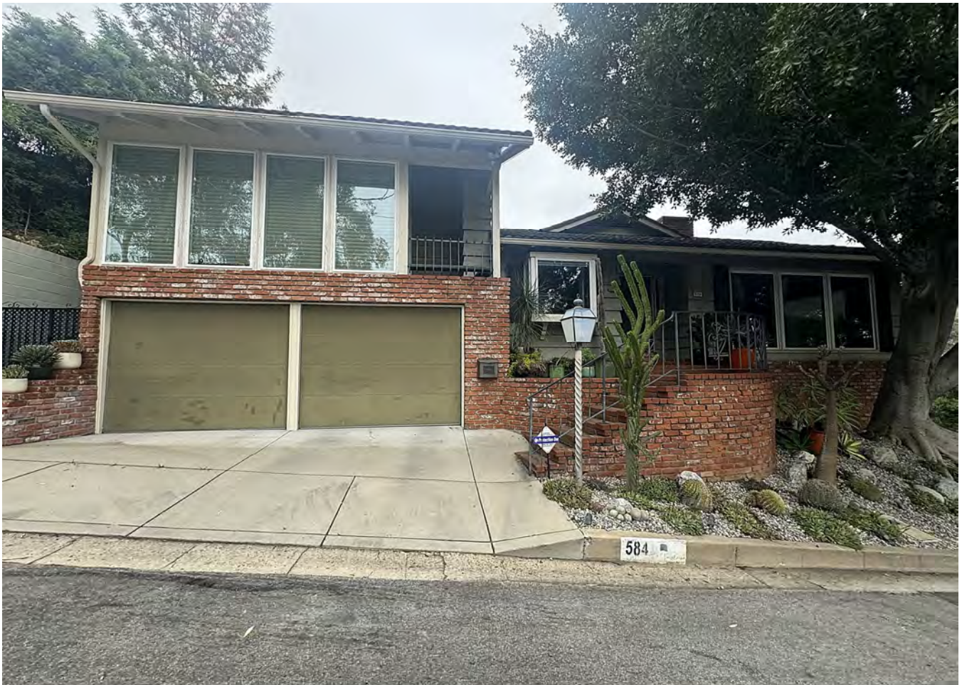
K. 584 ARCH PL