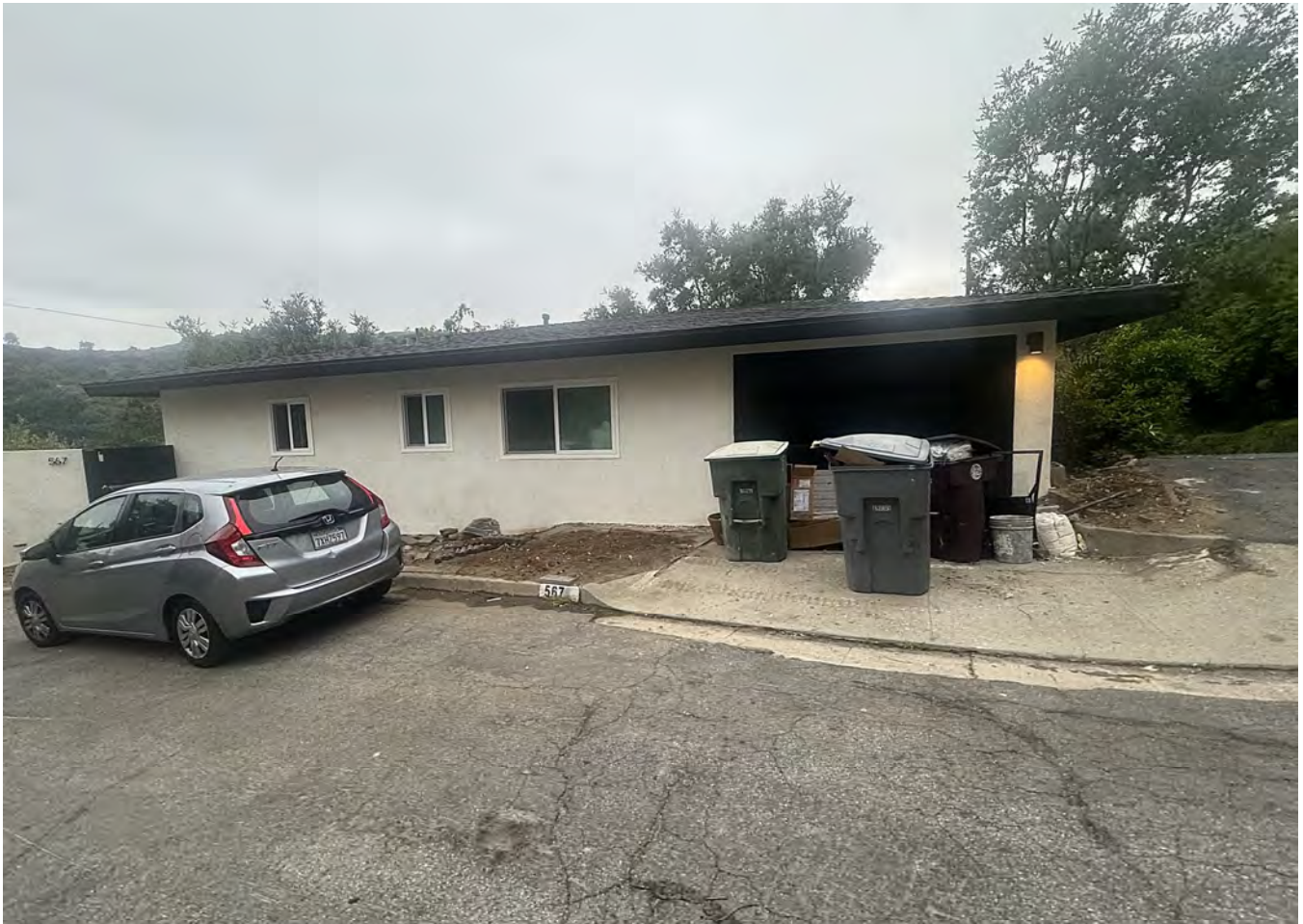
F. 567 ARCH PL