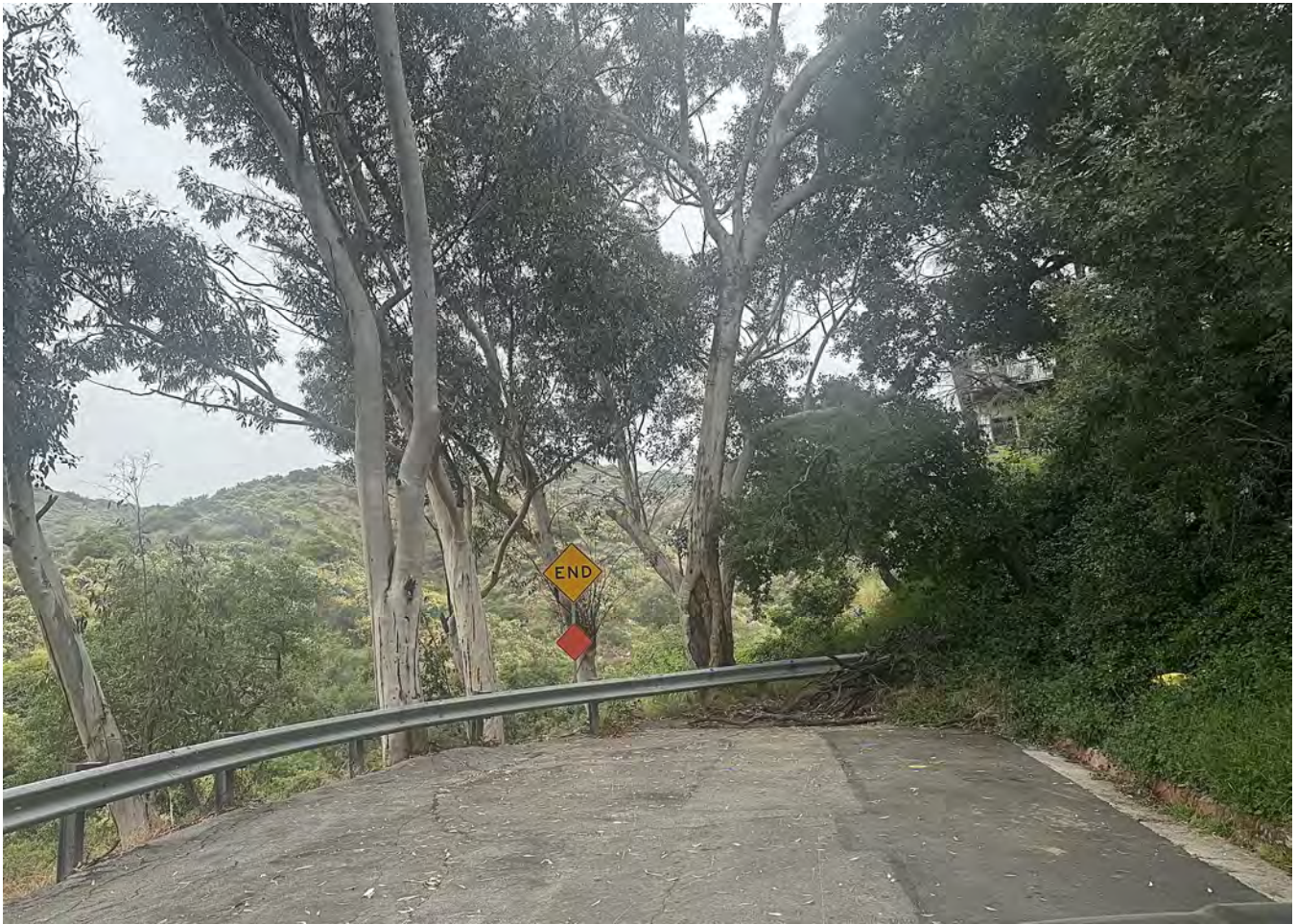
M. VACANT LOT | APN # 5666-003-002