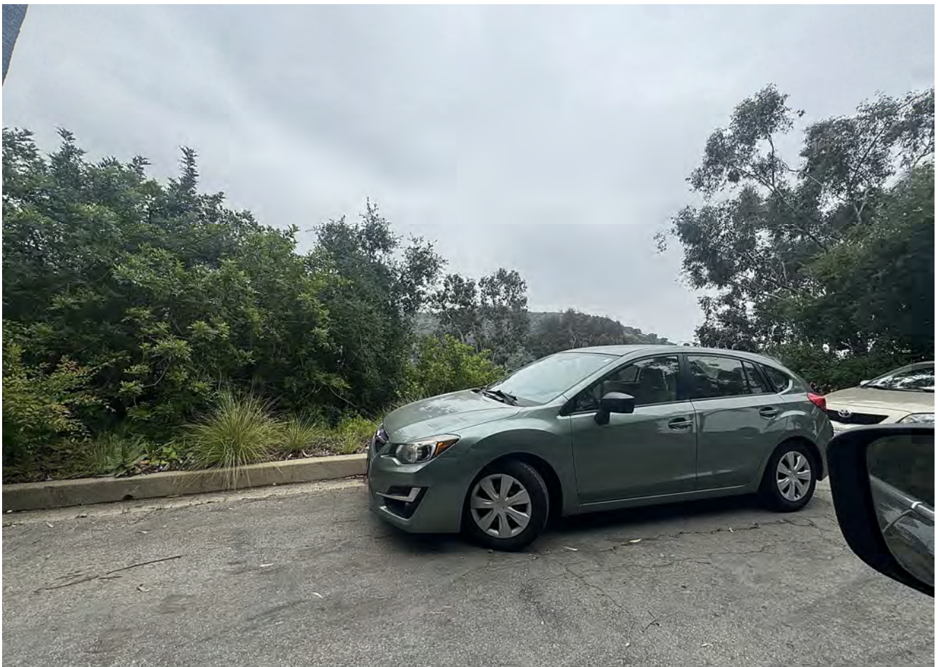
D. 577 ARCH PL