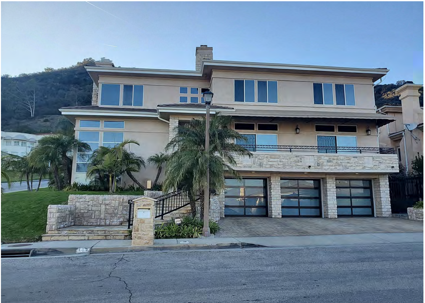
C. 3401 ESPERANZA TER