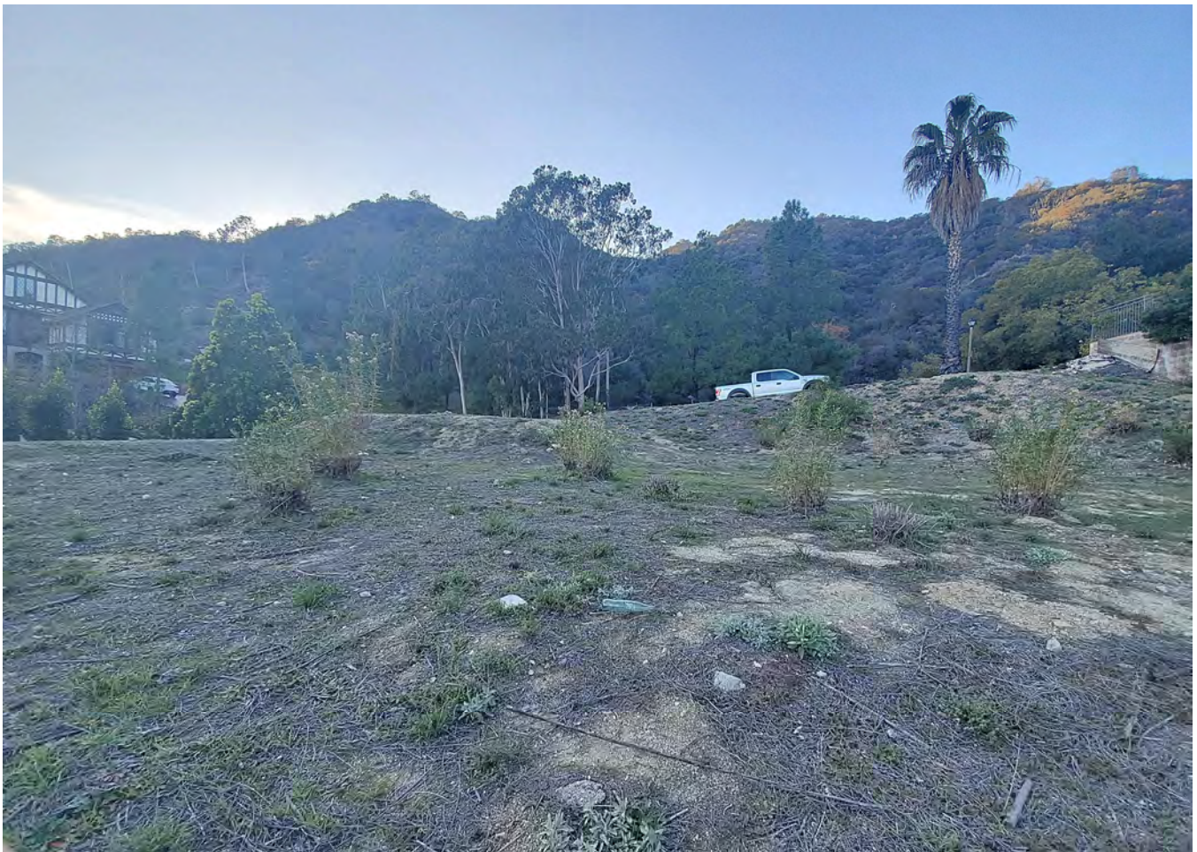
A. APN # 5616-021-036 (PROJECT SITE)