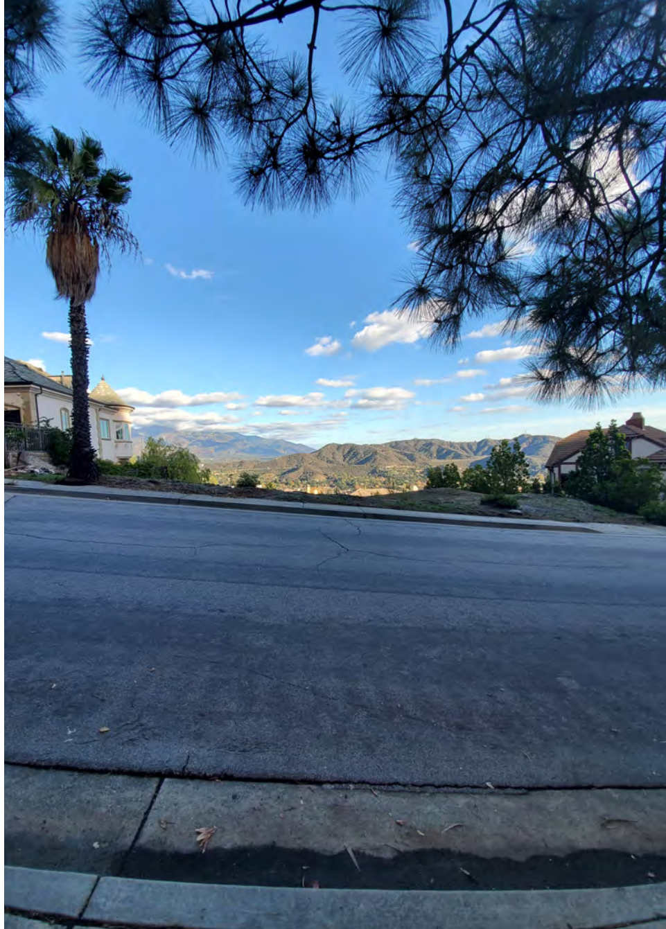
A. APN # 5616-021-036 (PROJECT SITE)