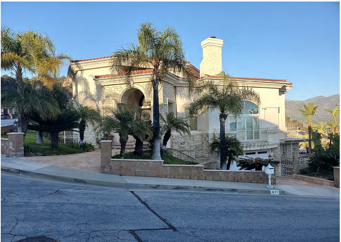
D. 3277 OAKMONT VIEW DR