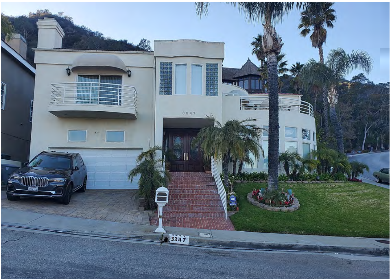
G. 3347 STEPHENS CIR