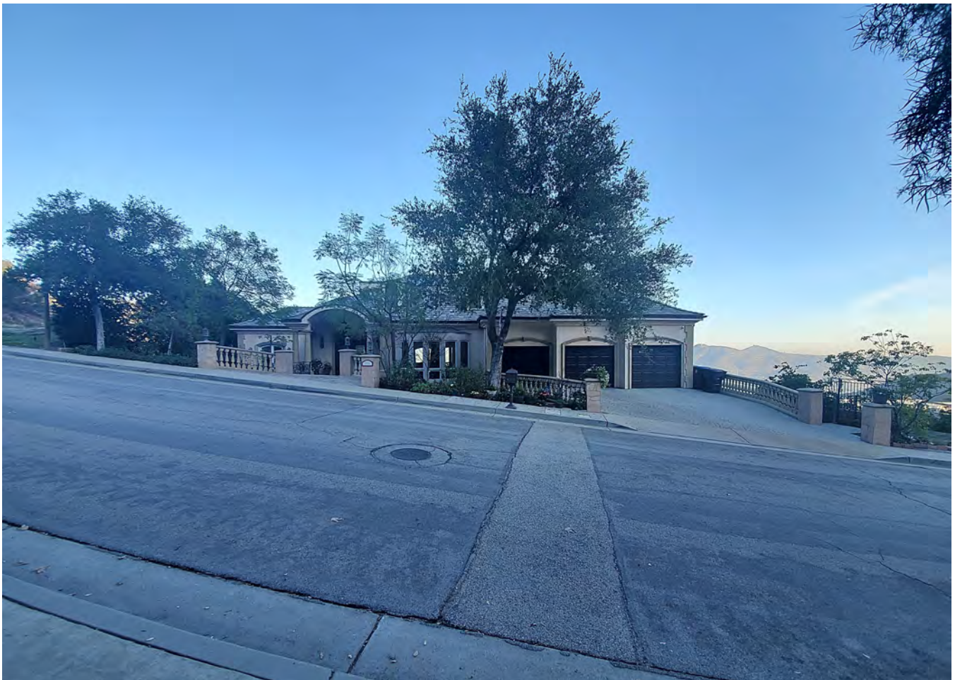
I. 2933 OAKMONT VIEW DR