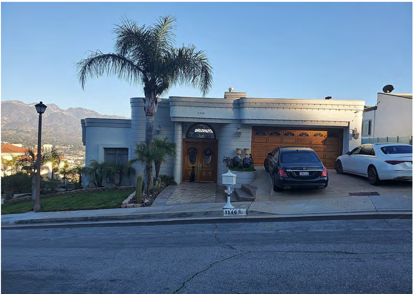
F. 3346 STEPHENS CIR