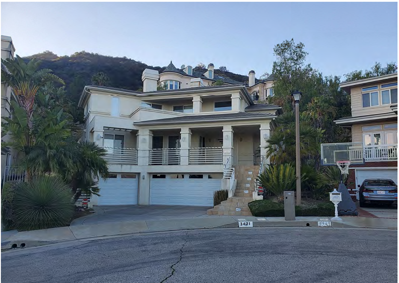
J. 341 ESPERANZA TER