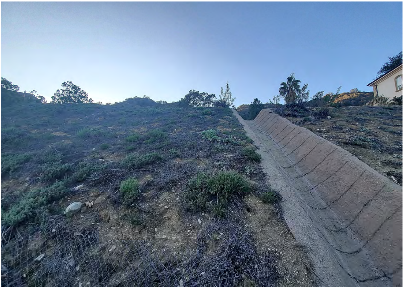
A. APN # 5616-021-036 (PROJECT SITE)