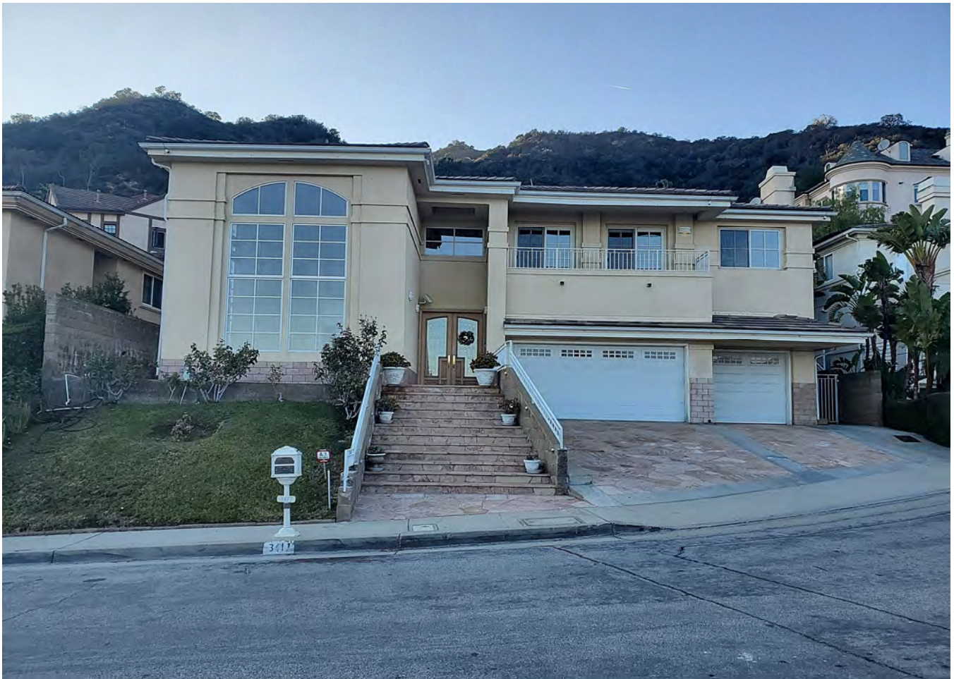
K. 3417 ESPERANZA TER