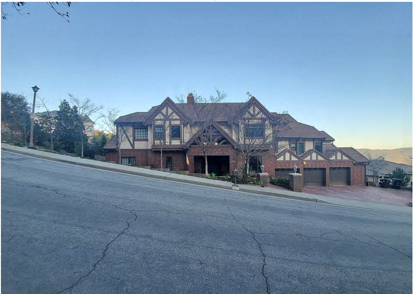
B. 2933 OAKMONT VIEW DR