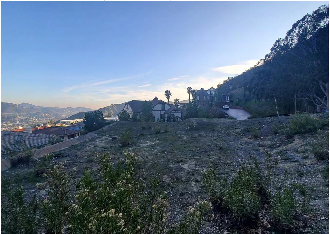
A. APN # 5616-021-036 (PROJECT SITE)