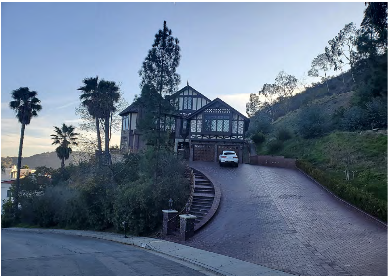
H. 2947 OAKONT VIEW DR