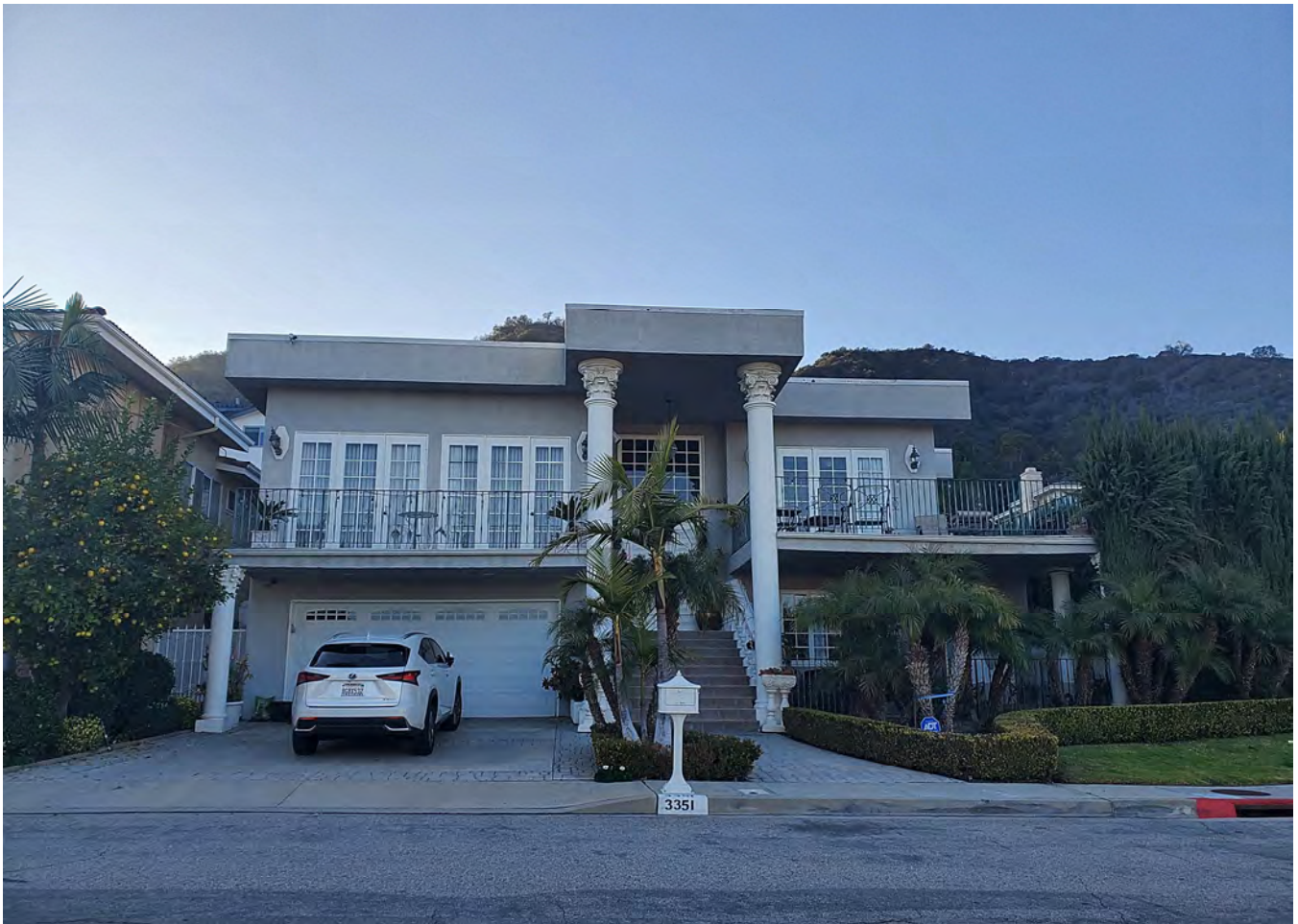
E. 3351 DEER CREEK LN