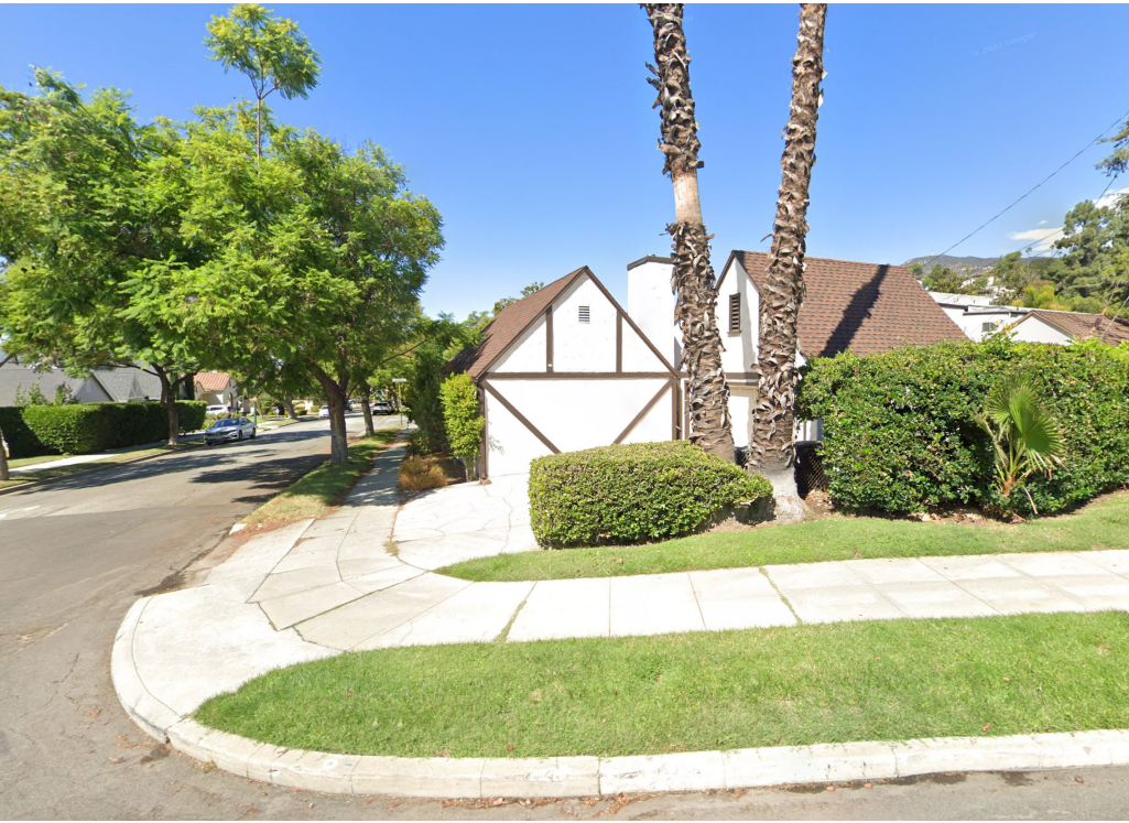
1222 CARMEN DR