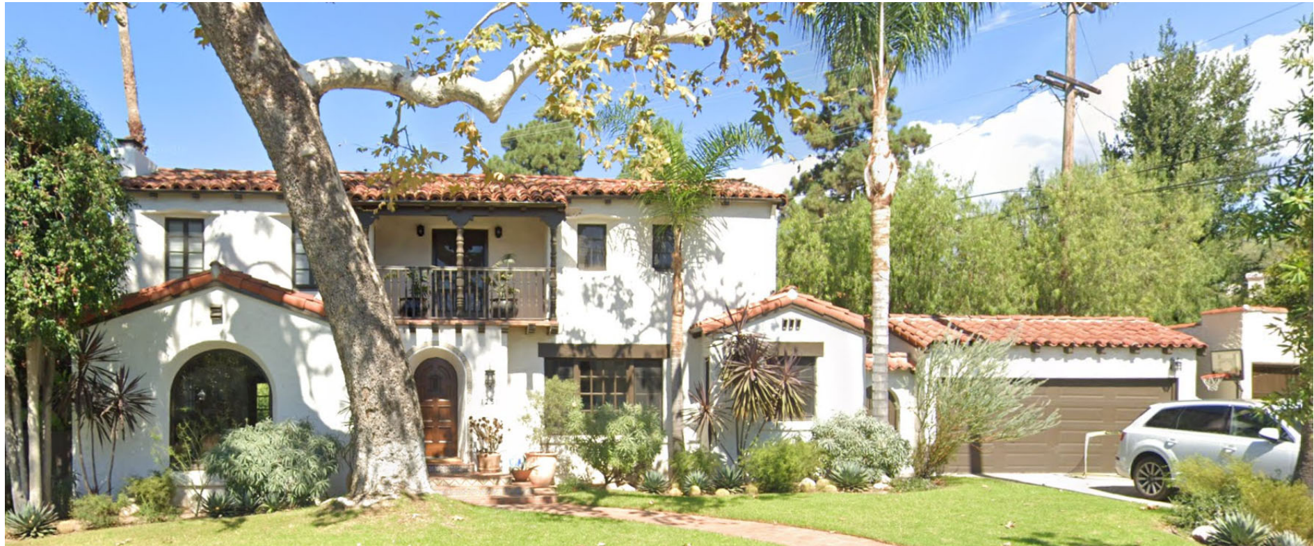
1251 ROSSMOYNE AVE