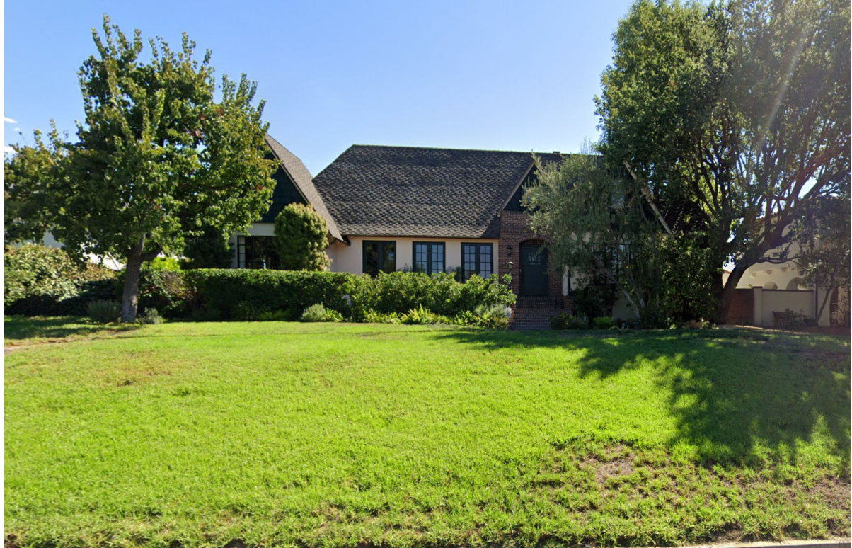
1216 ROSSMOYNE AVE