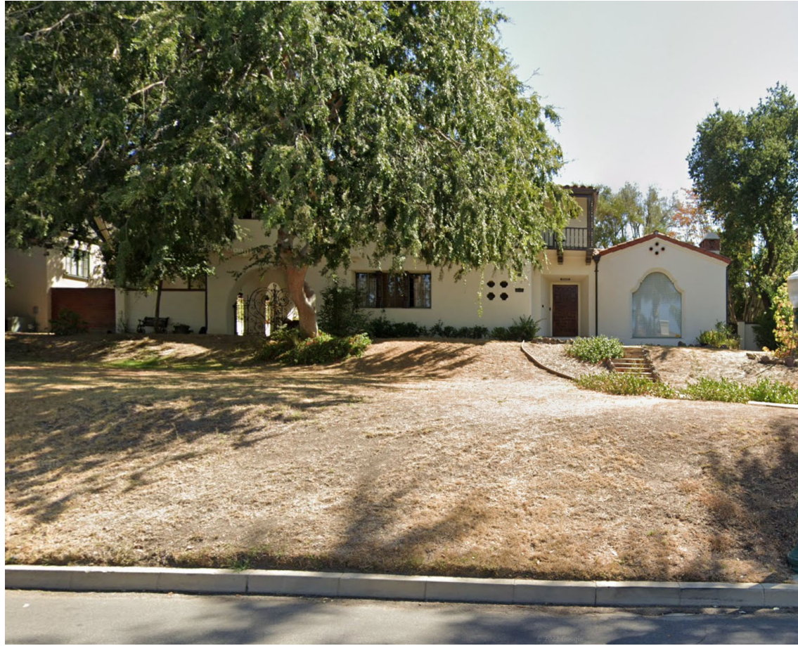
1212 ROSSMOYNE AVE