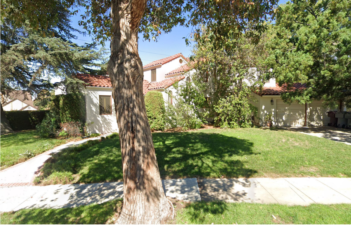
1231 ROSSMOYNE AVE