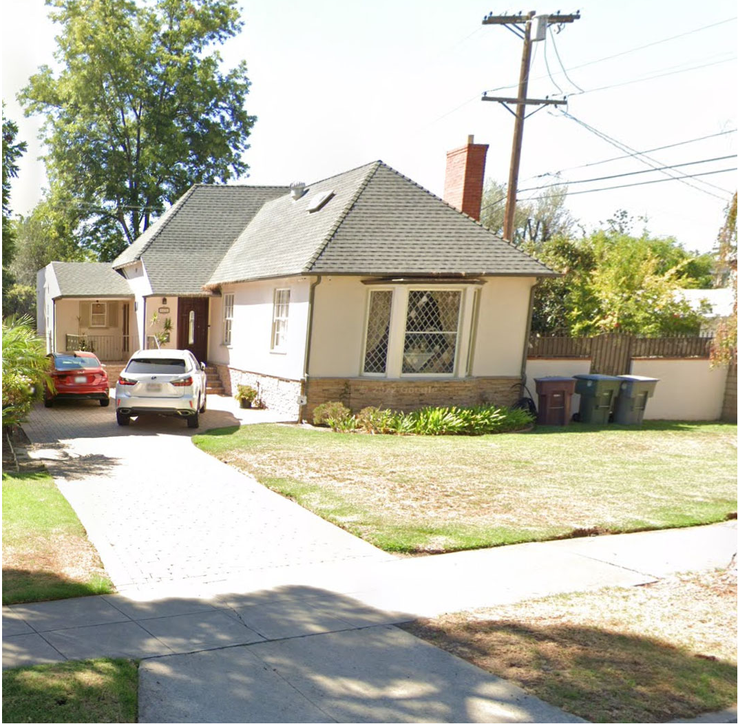
938 E MOUNTAIN ST