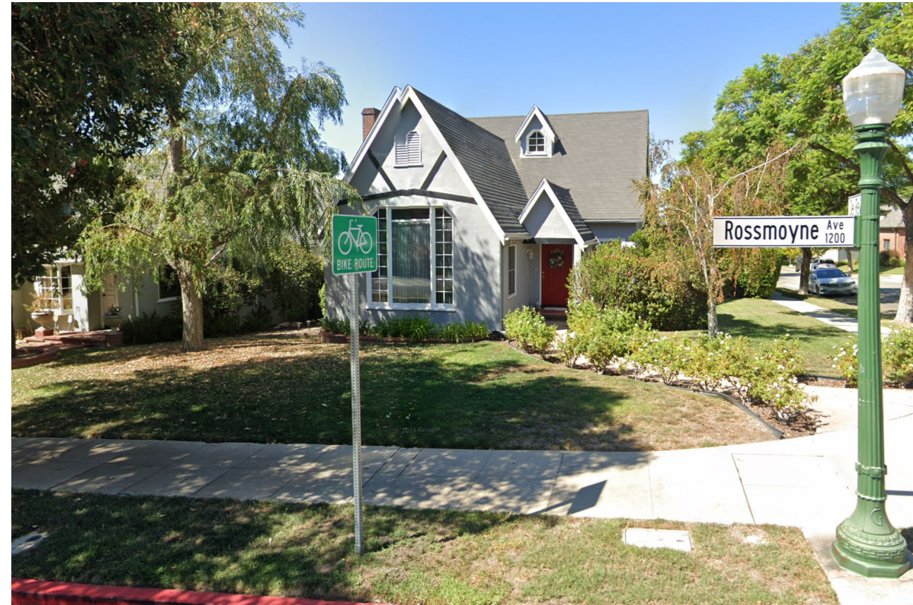
1217 ROSSMOYNE AVE