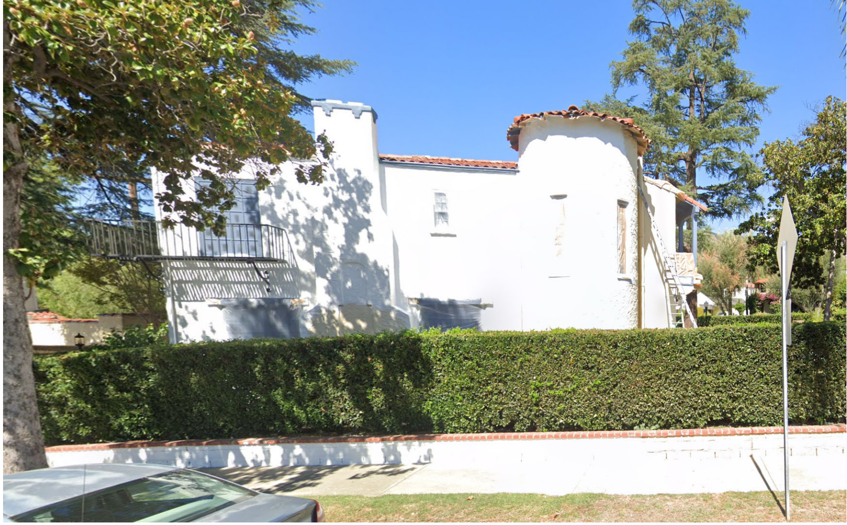
958 E MOUNTAIN ST