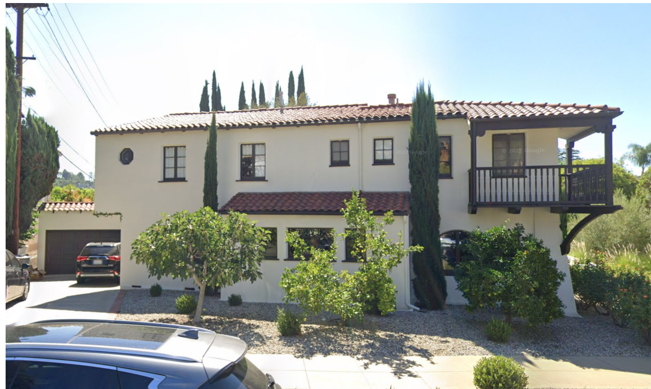
1240 ROSSMOYNE AVE