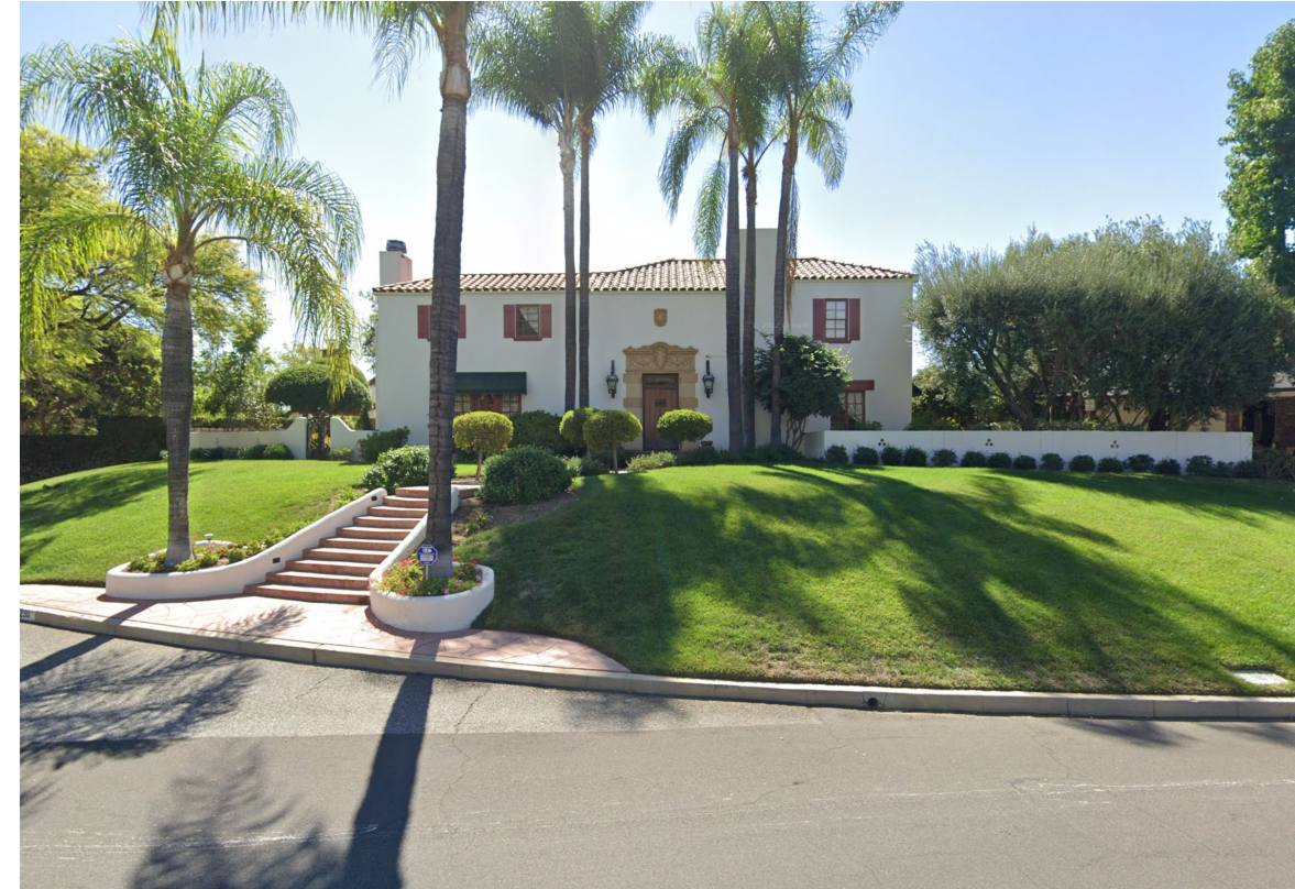
1230 ROSSMOYNE AVE