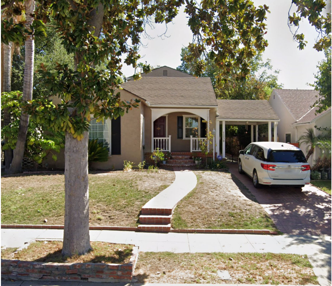
1238 CARMEN DR