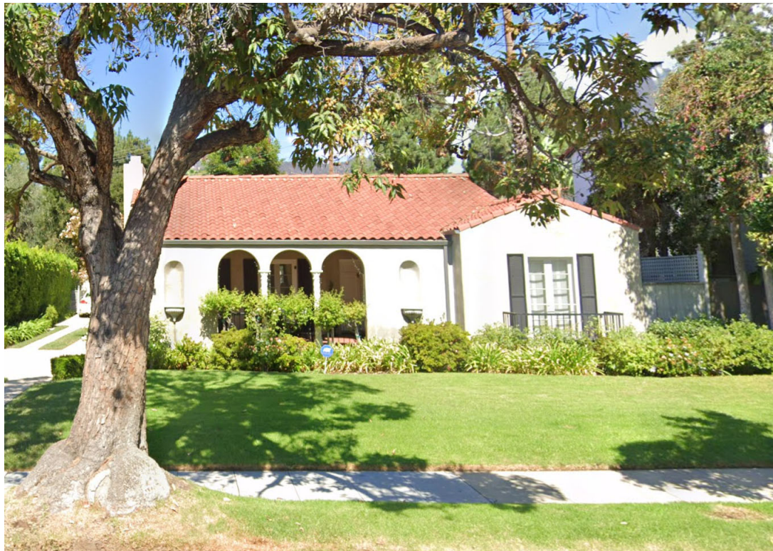
1243 ROSSMOYNE AVE