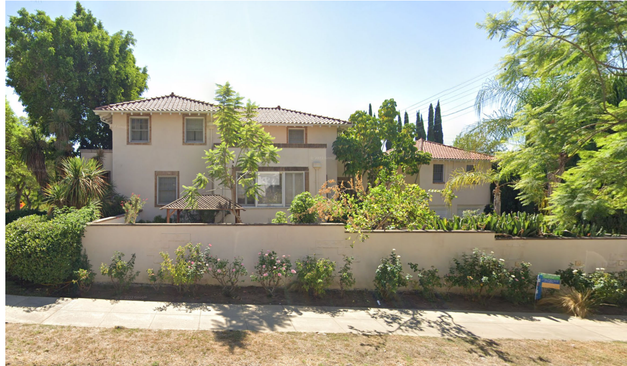
1000 E MOUNTAIN ST