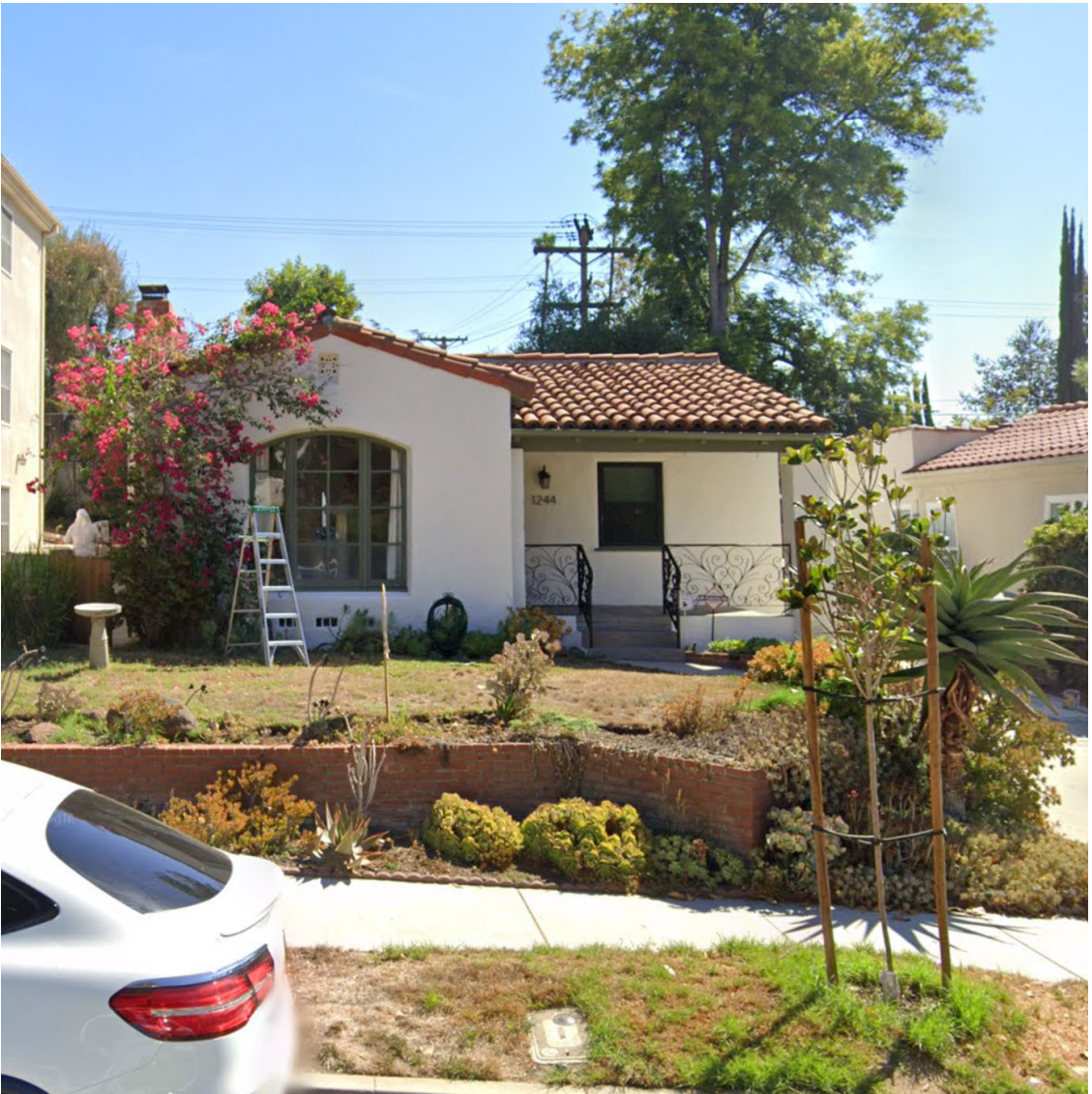
1244 CARMEN DR