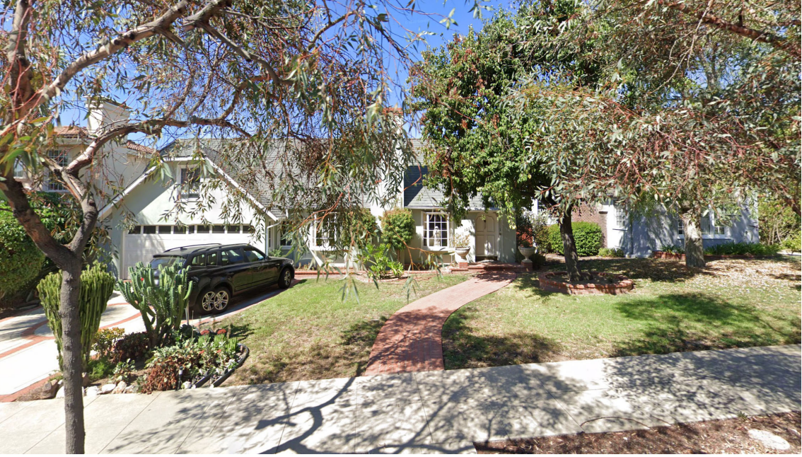
1213 ROSSMOYNE AVE