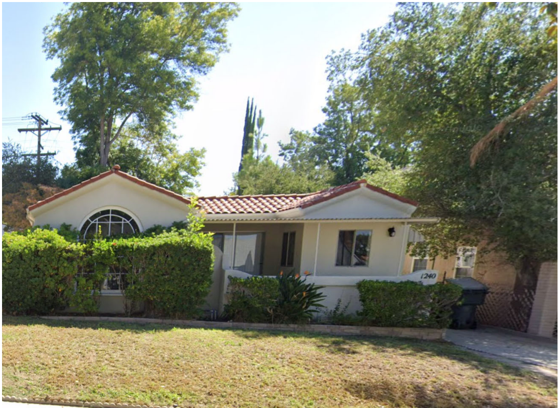
1240 CARMEN DR